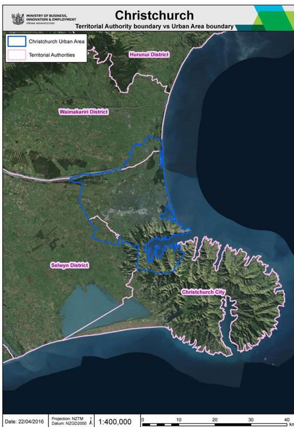
Figure 2: Councils and the Christchurch Main Urban Area

For example, the jurisdictions of Christchurch City Council, Waimakariri District, Selwyn District and Environment Canterbury are included in the Christchurch Main Urban Area. Figure 2 illustrates the boundaries of the three territorial authorities against this main urban area.