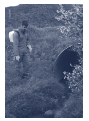
Strip spraying can work on emergent and bank vegetation.