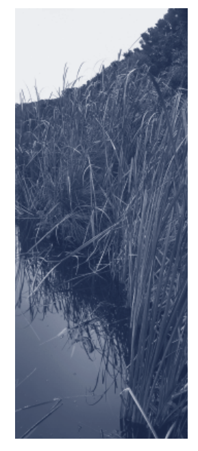
Encouraging plants to grow along drain banks improves erosion protection, habitat, food supplies, amenity and cultural values.