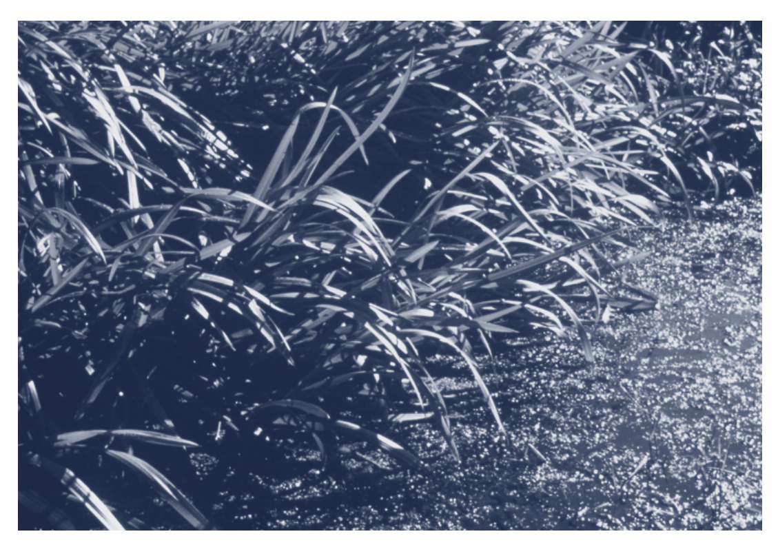
Glyceria is an aggressive aquatic plant pest and can form dense impenetrable stands in watercourses. It is troublesome in drains, slowing water flow.