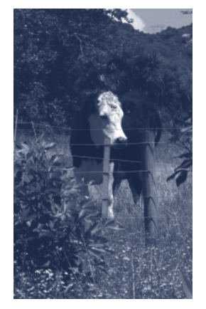
Excluding livestock from drains will generally reduce erosion and habitat degradation.

Bank reshaping: Banks are excavated to remove steep drops and unstable materials, and to lower the bank to allow roots to extend through potential failure planes and into the lower bank where there is potential for scour. Channel capacity may be increased by bank reshaping and marginal vegetation may filter contaminants and reduce flow velocities (See Biodiversity)