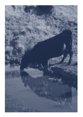
Poor water quality caused by farm runoff and livestock excrement can be a problem for drain systems.