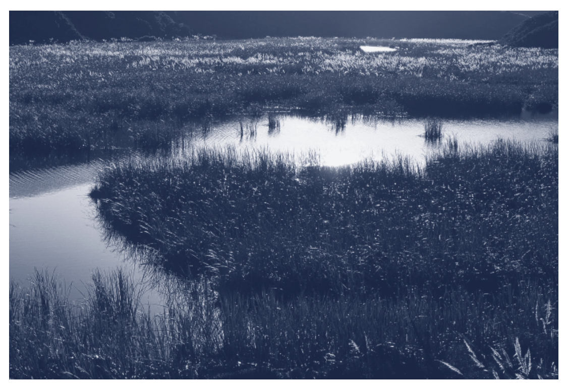
Many drains may be the remants of wetlands or streams prior to agricultural development.

Drainage of extensive areas of New Zealand caused significant loss or degradation of wetlands and streams. Many drains are new streams or remnants of meandering streams and wetlands that existed prior to agricultural development. These ecosystems often contain valuable fish populations and generally sustain diverse animal and plant communities. A central issue is how to avoid, remedy or mitigate adverse effects and provide optimum drainage management.