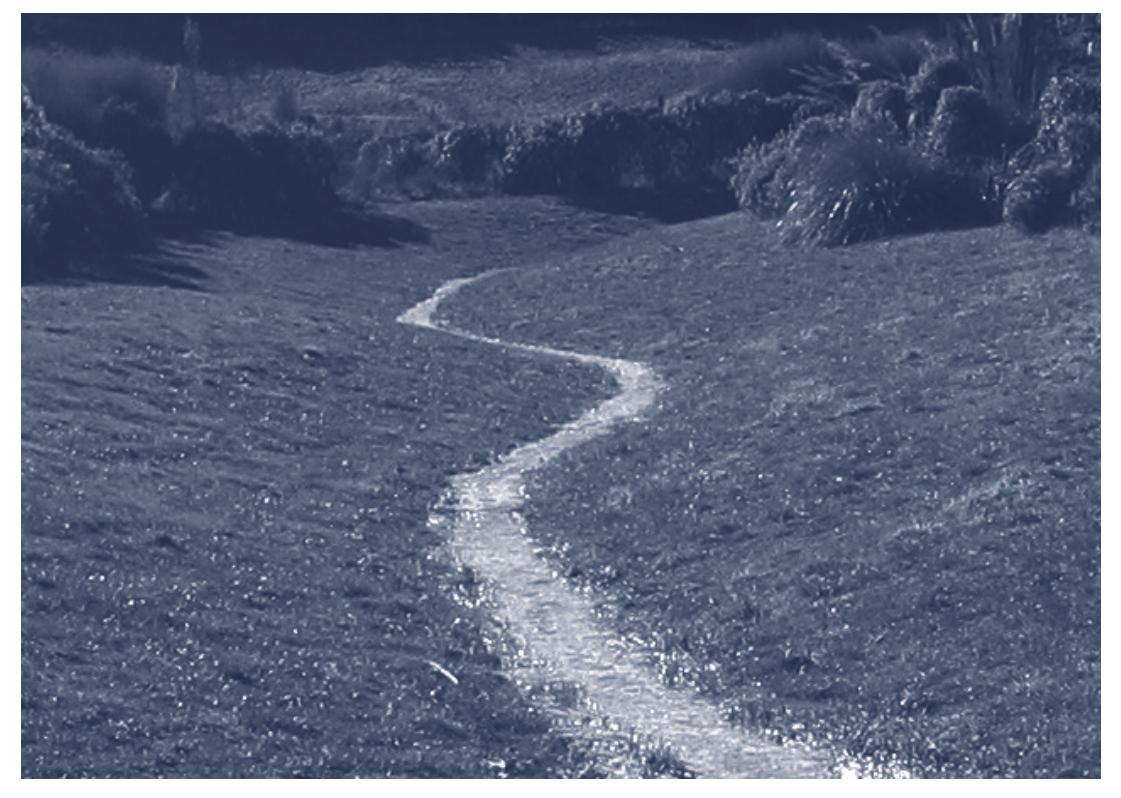
Grassed waterways have a low to medium effectivenes but such areas may have been high contributors of sediment before grassing.