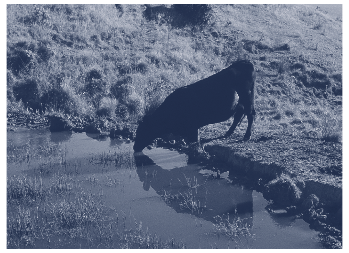
Preventing livestock from entering drains stops erosion (and a resultant increase in siltation) and reduces animal wastes entering waterways.

• Exclude livestock from waterways: Prevent livestock from entering waterways or trampling riverbank by fencing the stream margins. A primary benefit is the reduction of direct inputs of animal waste into waterways