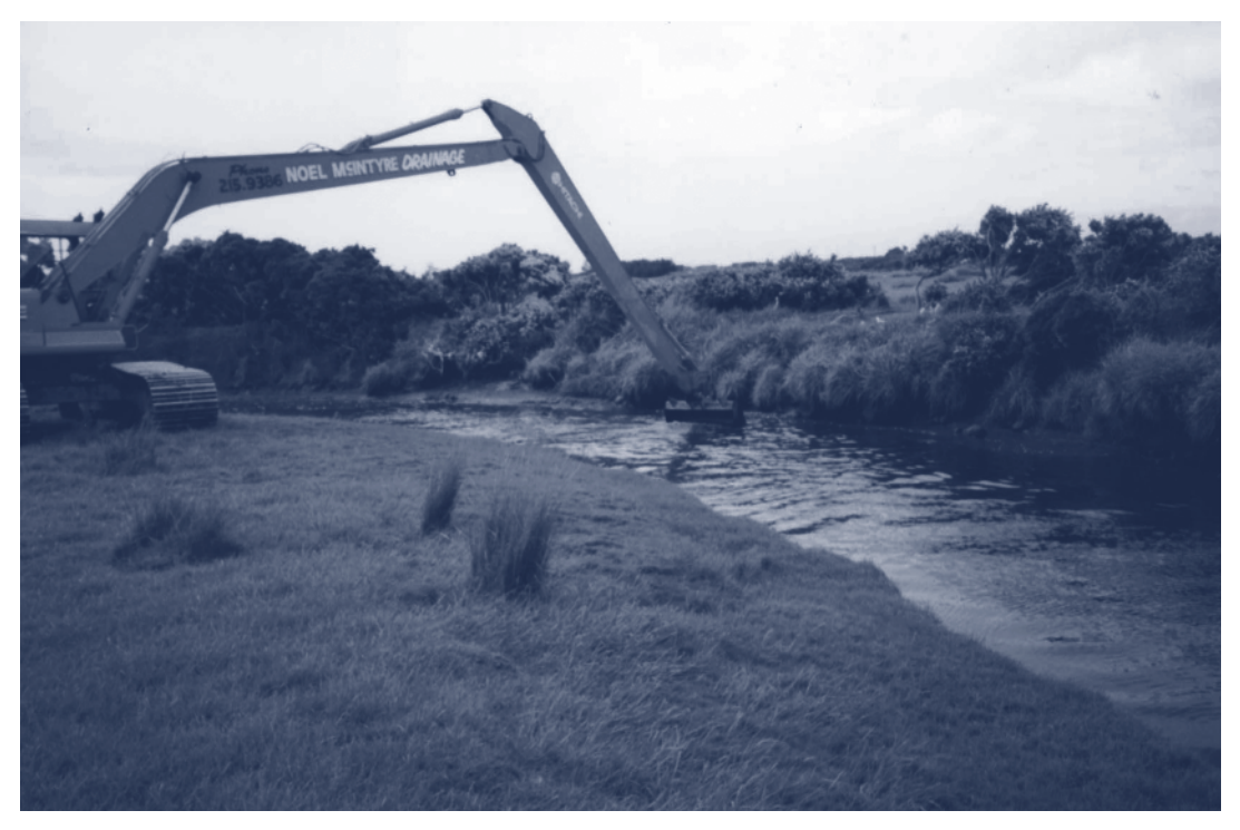
Sediment can be excavated to restore the hydraulic capacity (as above) but a more proactive approach is to trap sediment at preferred locations by using coarse sediment traps.

A more proactive approach is to trap sediment at preferred locations. This limits the length of channel that is disturbed, reduces costs, and improves habitat: