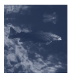
Trout need an adequate food supply, suitable dissolved oxygen levels, cool stream temperatures, instream and overhead cover, clear, clean water; and clean gravel for spawning.