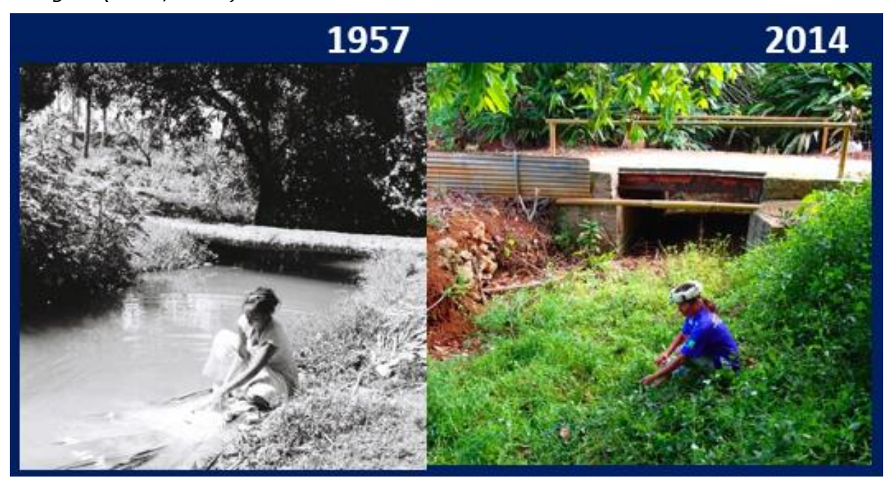
Photograph 3: Example of water tanks provided on the Southern Group outer island of Atiu on the image on the left; A local resident manually testing flow rates from a potential water source in Mangaia on the image on the right (CCCI and PEGU, 2016)