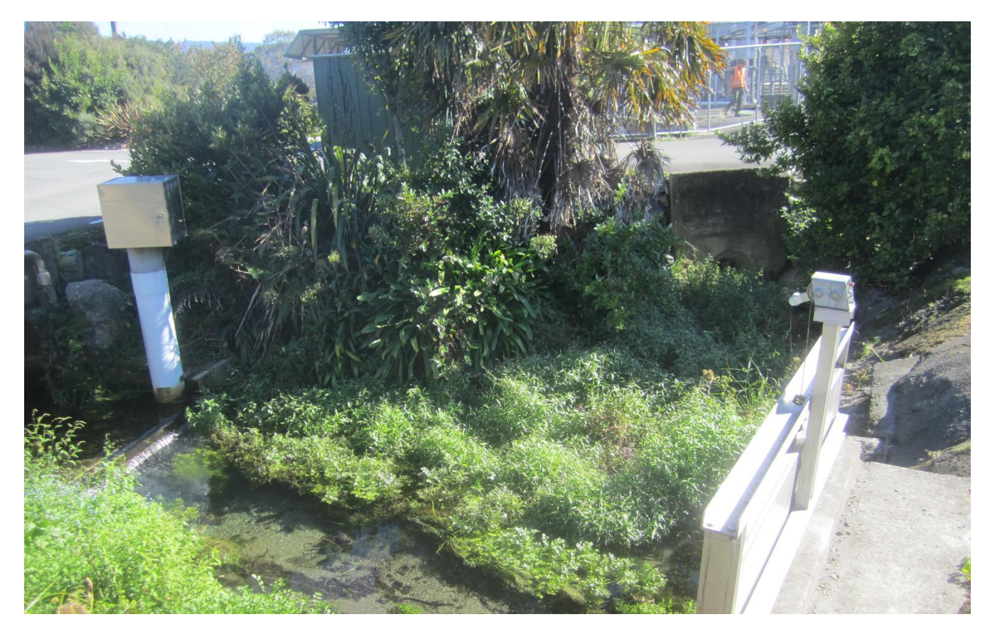
Photograph 4.1: Receiving waterway at the Takaka site

around the site was sampled 6 times throughout a single rain event. While the sampling did not target spill events the information was important to help indicate the typical contaminants from each catchment and match an appropriate solution to each catchment. This information was also critical in selecting the appropriate treatment.