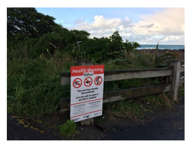
Ratepayers asked to contribute millions towards infrastructure