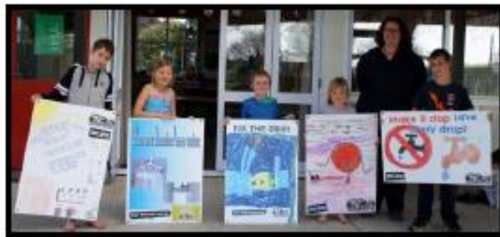
The winners with their posters!

Schools promoting on their website or in their newsletters.