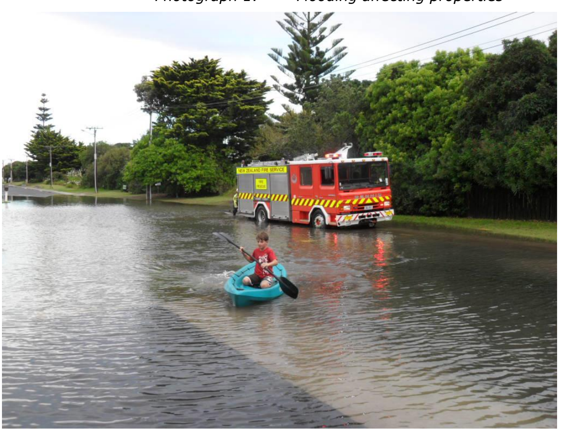
Photograph 2: Flooding on Streets – Kids are always innovative.