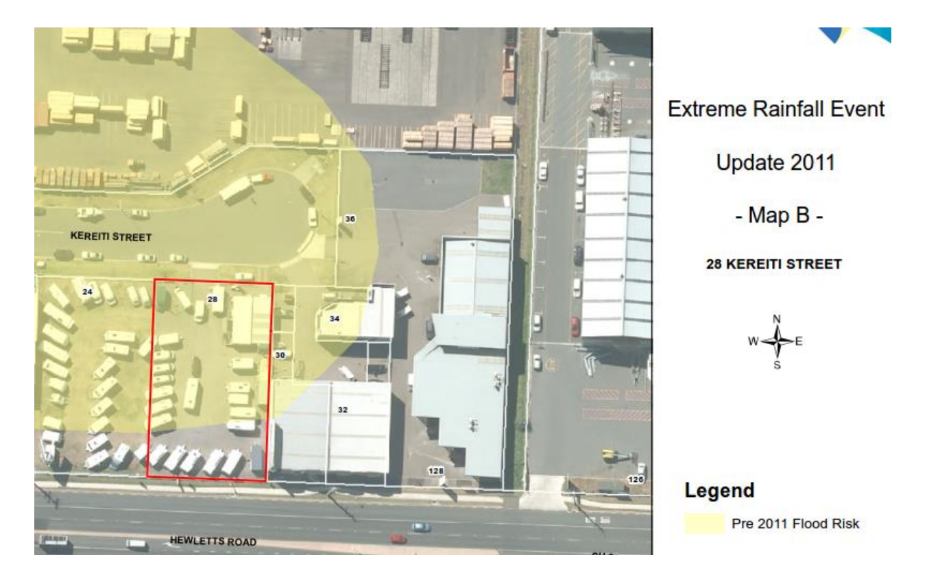
Figure 7: Map B - Pre 2011 Flood Risk Layer