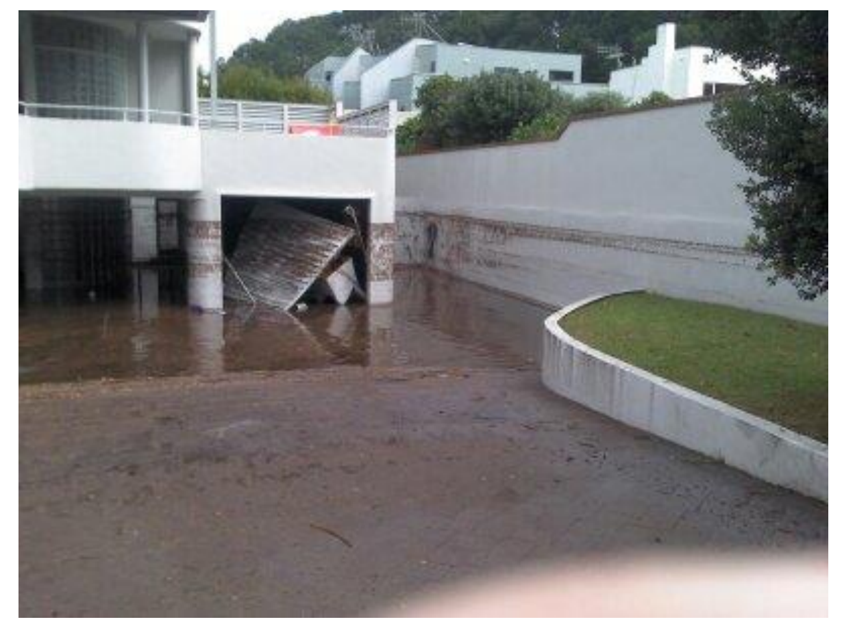
Photograph 4: Flooded Dwelling - Note the Water Level