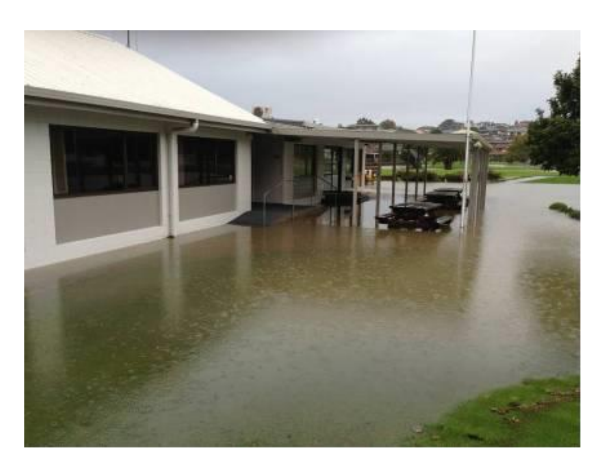
Photograph 1: Flooding affecting properties