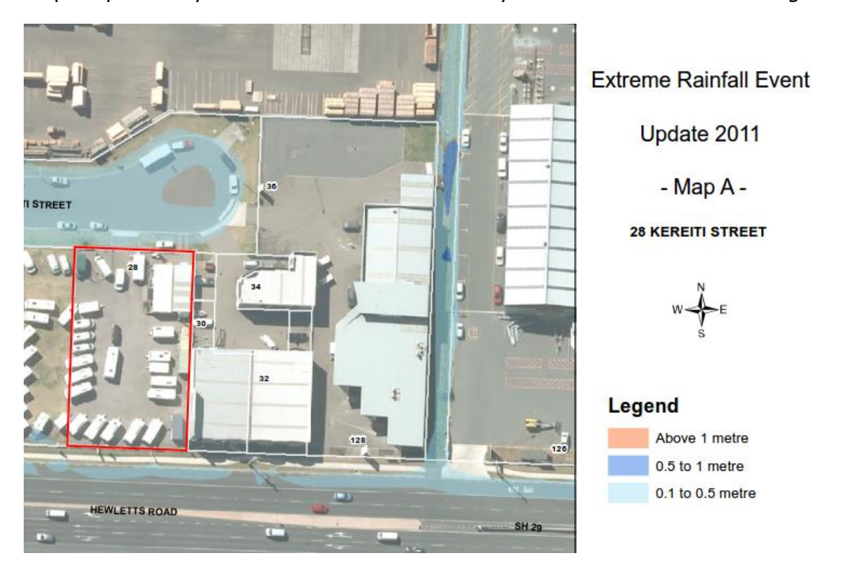
Figure 6: Map A - Revised Flood Risk Layer

Map B specifically showed them - this is what you used to look like. See Figure 7.