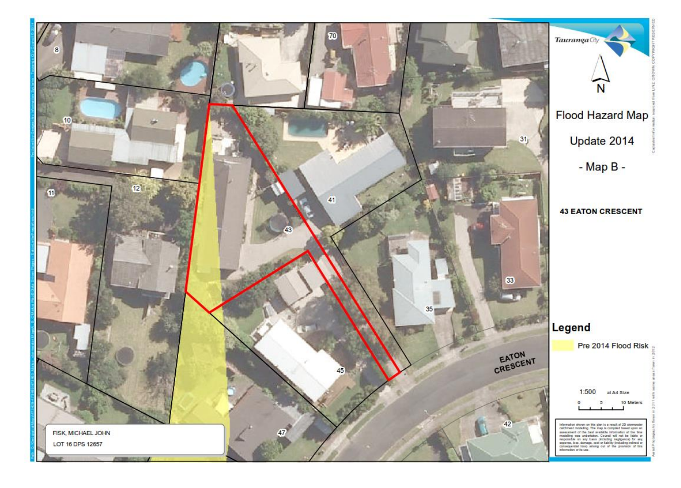
Figure 5: Map B - Pre 2014 Flood Risk Layer