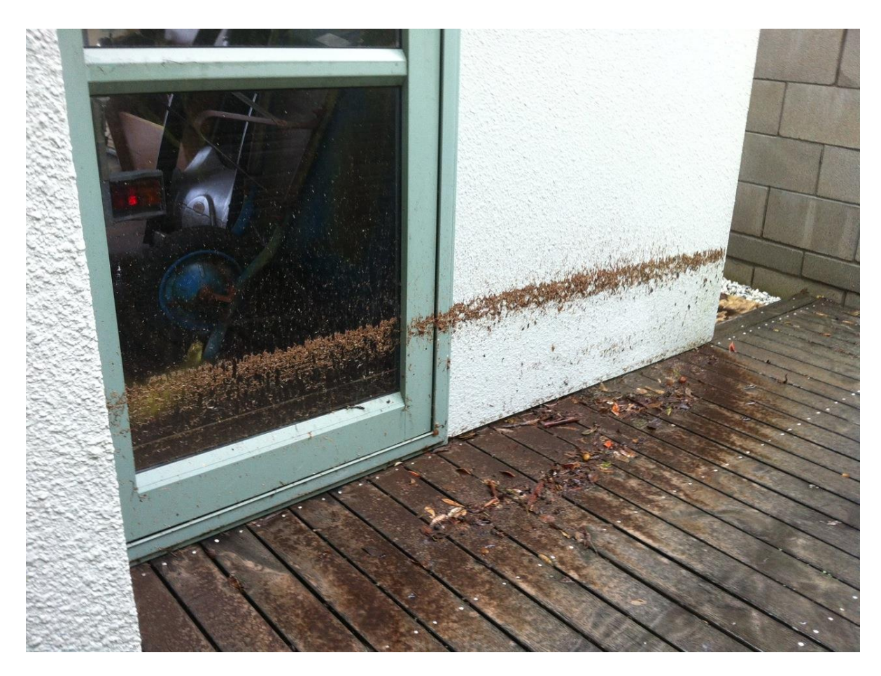
Photograph 3: Flooding Affecting Properties