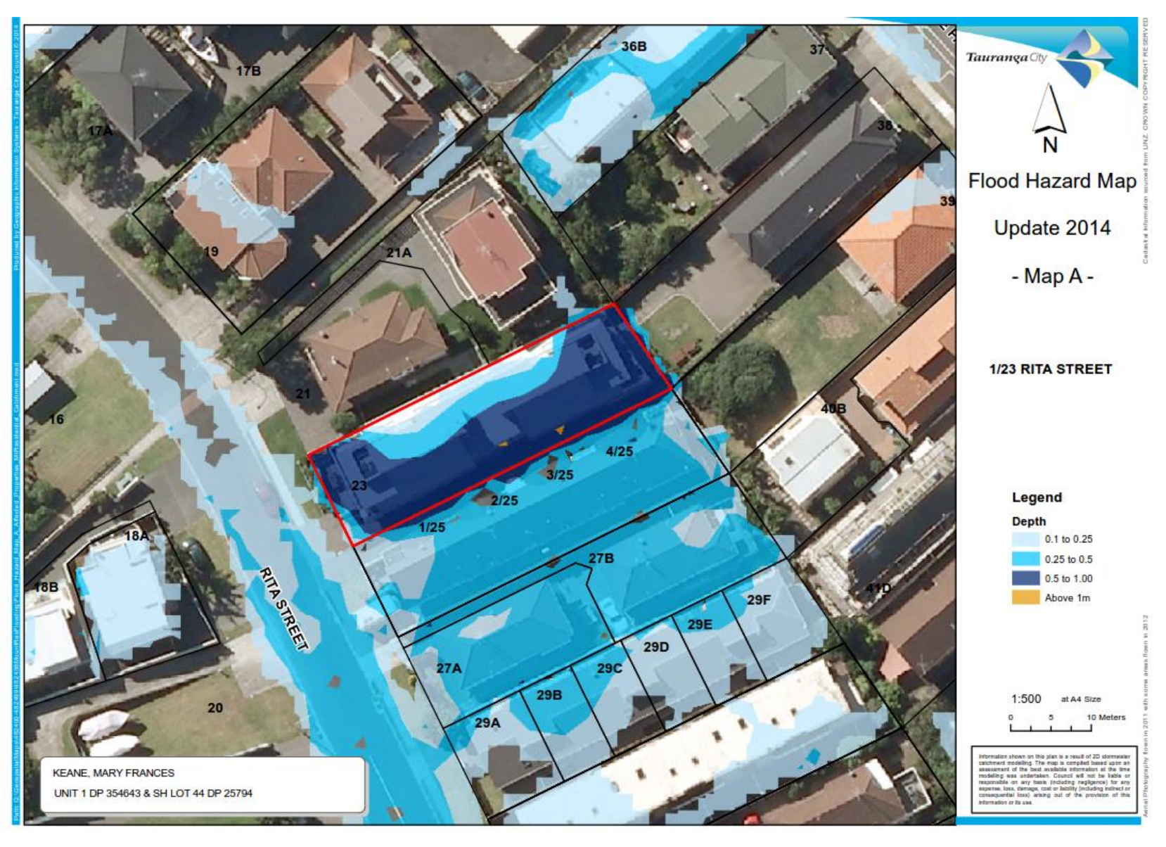
Figure 9: The Flood Hazard Map