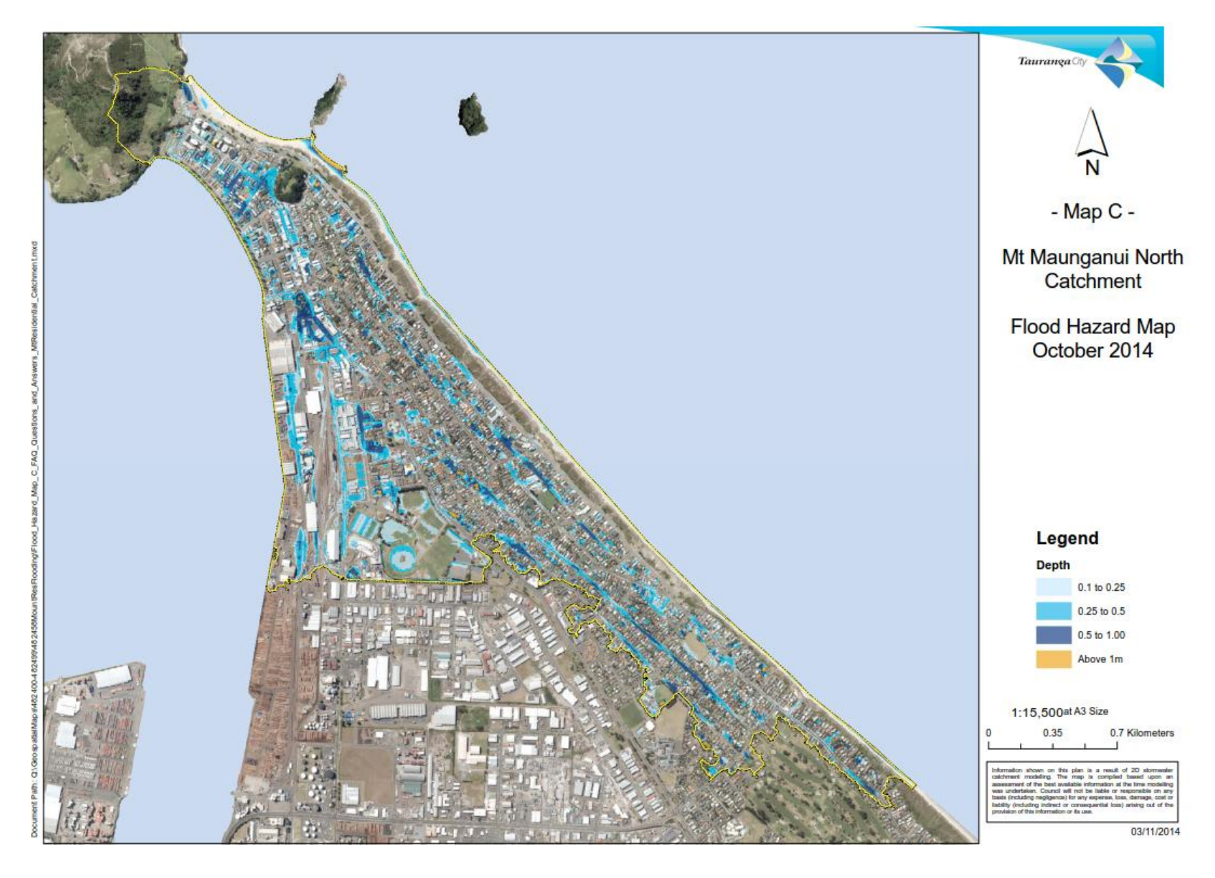
Figure 2: FAQ - Page One