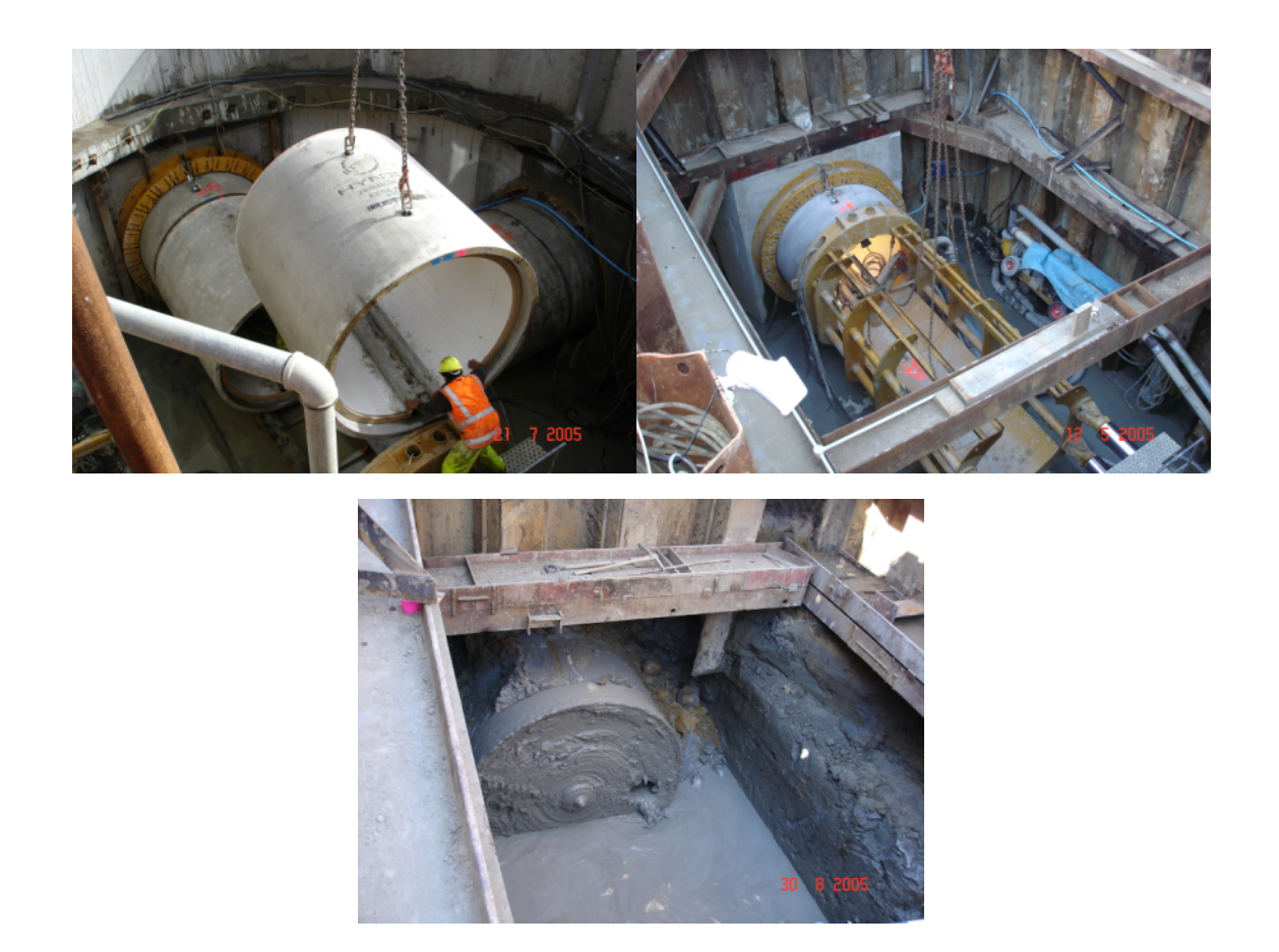
Photographs 1 to 3: Browns Bay 2.1m diameter pipeline - Installing Pipes Prior Jacking / Jacking Shaft / Micro tunneling Machine Head Entering Reception Shaft