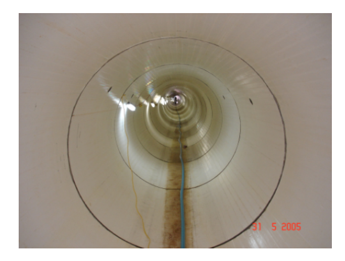
Photograph 6: PVC T-Lock Liner in Browns Bay 2.1m diameter sewer