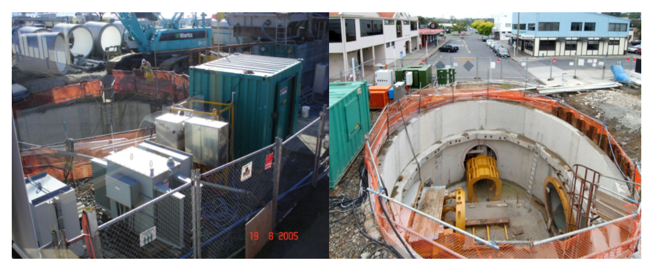
Photographs 7 &8: Jacking shaft site on micro tunnelling project in Browns Bay

The photographs below show the significant amount of plant that exists at a jacking shaft site, highlighting the importance of laying out the site appropriately for efficient operation.