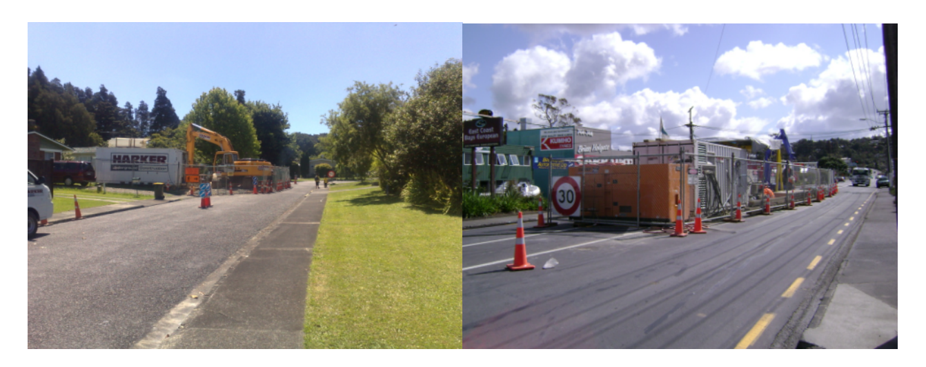
Photographs 4 and 5: Jacking Shaft Sites in Suburban Areas

Avoiding damage to existing utilities has become increasingly important due to safety issues, high expense of repair (particularly for fibre optic cables) and disruption implications including fines and major public inconvenience. Micro tunnelling is generally considerably deeper than other utilities, and typically only affects utilities at temporary shafts, where service diversions can be planned in advance of the shaft construction. Nevertheless, trenchless construction is far from disruption-free and can be criticised for unfair distribution of the disruption that still results. Consultation requirements during the consenting phases can become <u>more</u> difficult as a result and need to be appropriately managed.