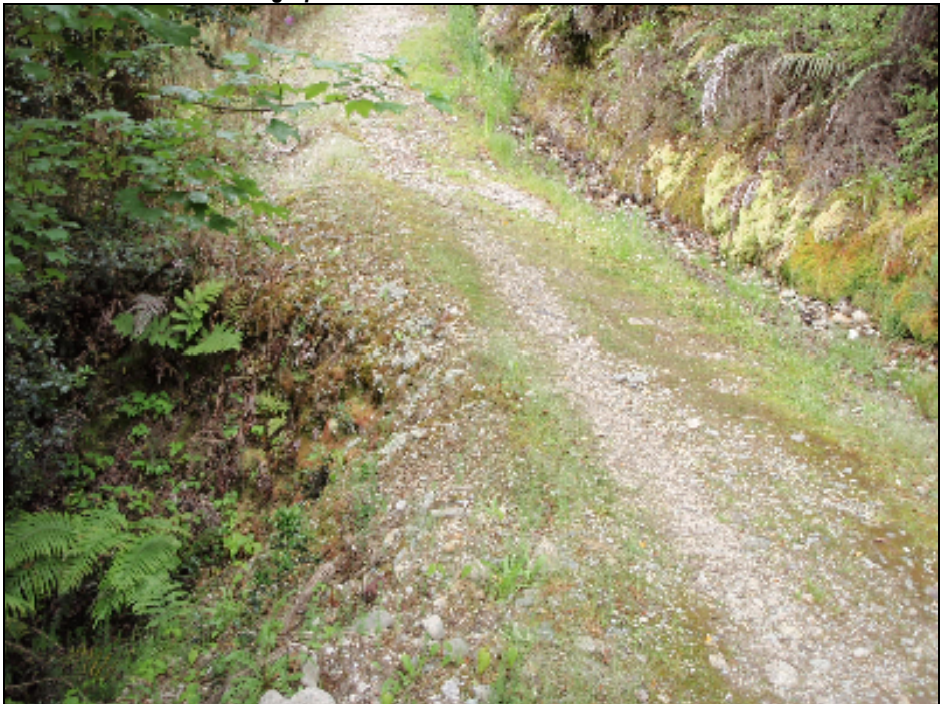
Photograph 3: Section of access track to reservoir

Site access is by a steep, narrow and winding four-wheel drive track that would be unsuitable for access by any kind of crane truck. A section of the track can be seen in Photograph 3 . Due to very difficult access to the site, different material options for the solid roof were considered, based on their ability to be either constructed on site or lifted to site with a helicopter. A steel frame solution was ultimately adopted.