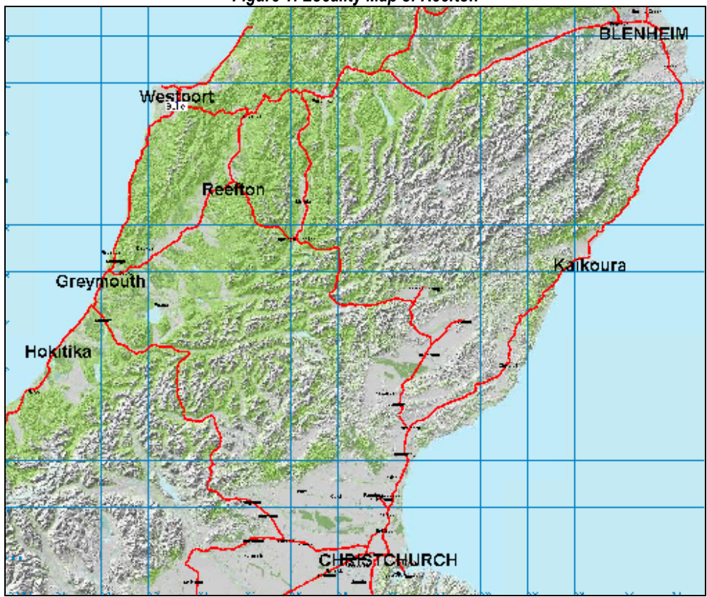
Figure 1: Locality Map of Reefton

Figure 1 presents a locality map of Reefton.