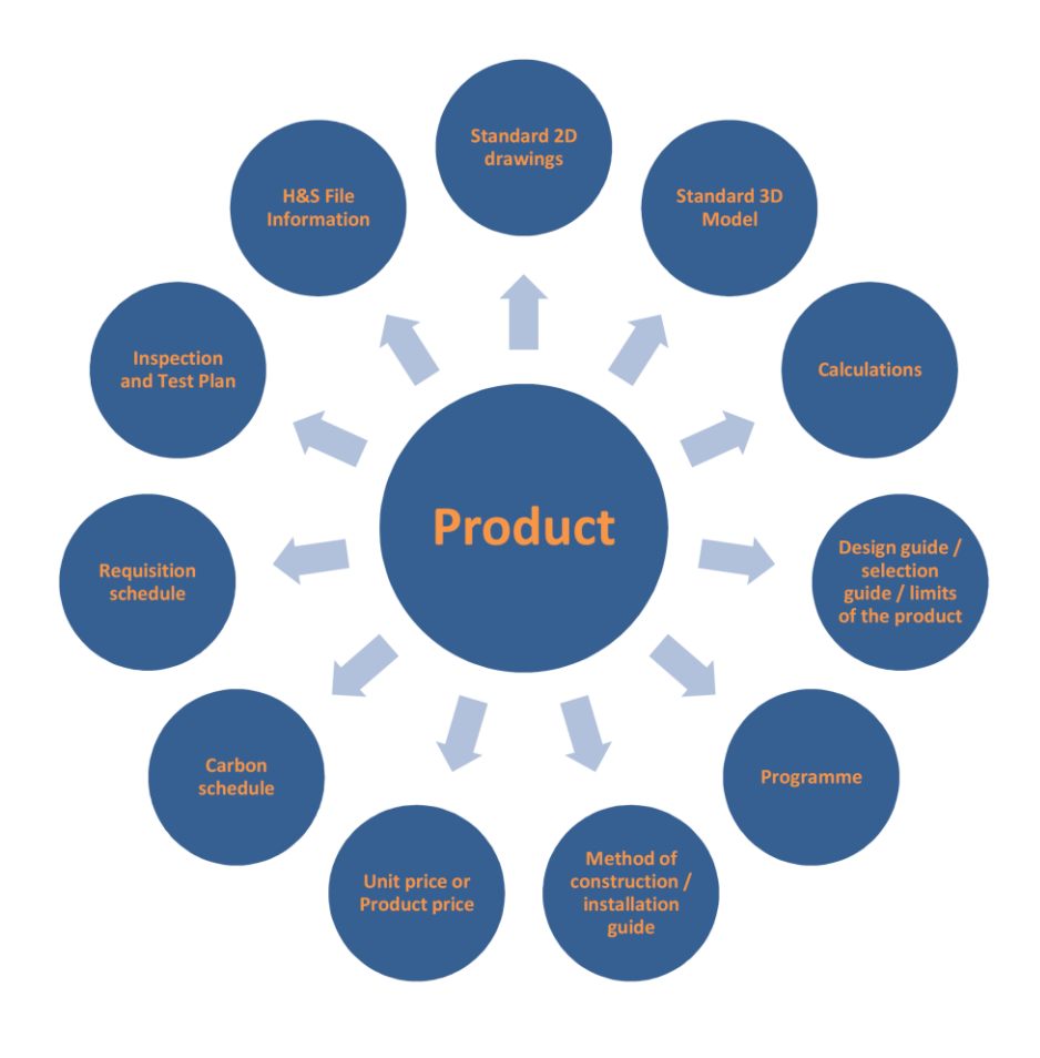
Figure 1: Product, represented by standard design and documentation

Buoyed by the success of the @one Alliance in pioneering the use of product-based delivery, other organisations working in the UK water industry have embarked on developing their own standard products. Design and build contractor Mott MacDonald Bentley (MMB), part of the Mott MacDonald Group, has developed a catalogue of over 80 standard products to suit its water sector clients' varying requirements. All products consist of a range of standard documentation, as shown in Figure 1. Unlike the @one Alliance, MMB embraces both offsite solutions and on-site ones, delivered through its in-house skilled labour force where this is found to be more efficient, illustrating how a one-size-fits-all strategy is not necessary.