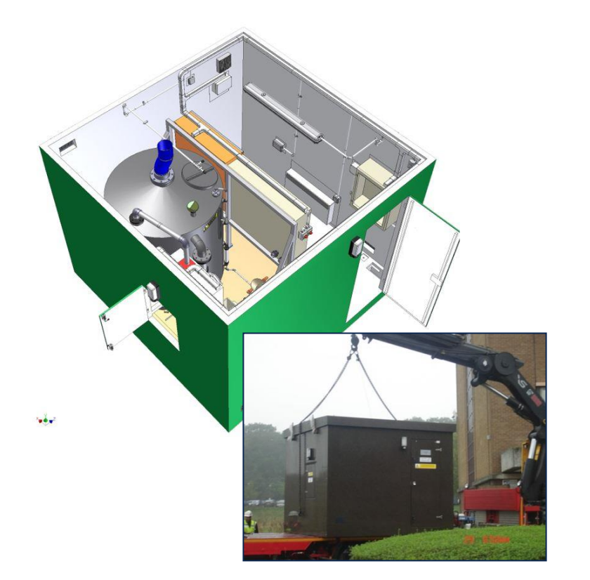
Figure 2 – Evolution of a dosing package