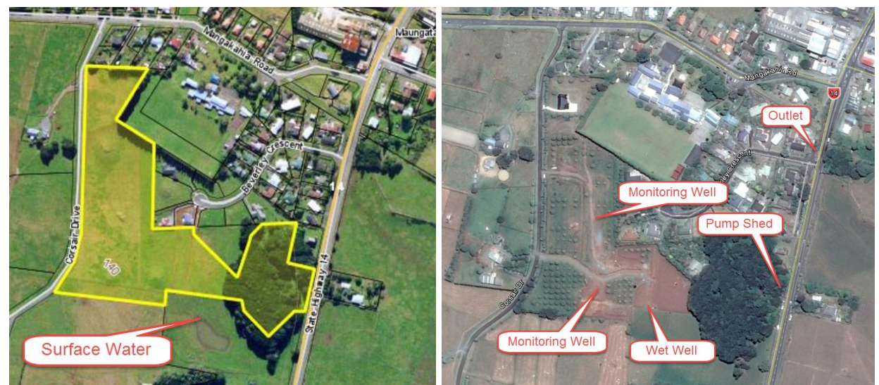
Figure 1: 2002 aerial image showing ponded surface water. A recent satellite image taken during construction

The site resides within a larger 42ha basin catchment formed by a gently undulating basalt plane. The neighbouring property to the south of the site is the lowest point within the basin and is frequently inundated by standing water during winter months, with inundation extending into the Te Mara property periodically each year.