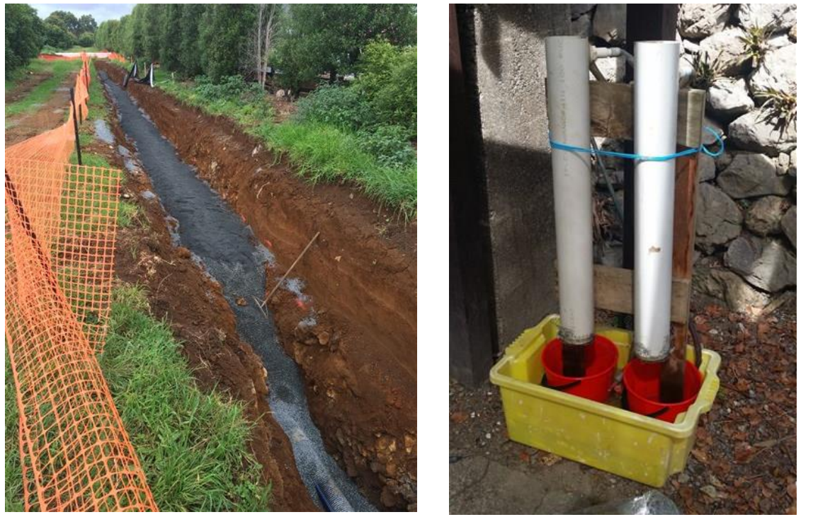
Figure 2: Rain garden during construction showing subsoil, drainage aggregate, and blinding. Percolation testing of rain garden material build up.

Conveyance of stormwater from the right of ways and individual lots was achieved in a 2 - 2.5m wide 700m long rain garden running through the subdivision. The rain garden discharges over a weir at the southern boundary in the location of an existing surface drain. The rain garden surface is 700mm below the sites average ground level and set 200mm below the downstream drain invert level, providing a treatment volume.