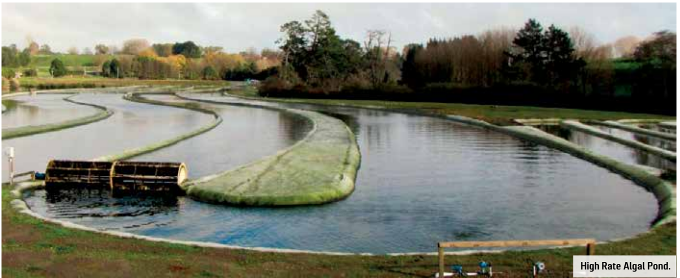
High Rate Algal Pond.

e.g. activated sludge, systems unless there is substantial energy recovery.