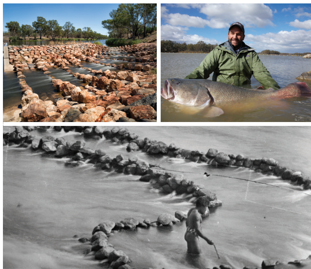
(Top Left) Rock Ramp Fishway, (Top Right) Large Cod, (Bottom) Aboriginal Fishtrap at Brewarrina (Photography c.1880-1900)

Our chosen location for the conference is at the headwaters of the Murray River, the lifeblood of the largest river basin in Australia. The Murray-Darling Basin embodies a diverse range of fish passage works and is home to an array of innovative solutions that are underpinned by a long-standing cooperative approach between engineers, scientists, managers, and asset owners. Being the centre of fish passage innovation in Australia for well over a decade, it is apt that the Murray-Darling Basin hosts this major international event.