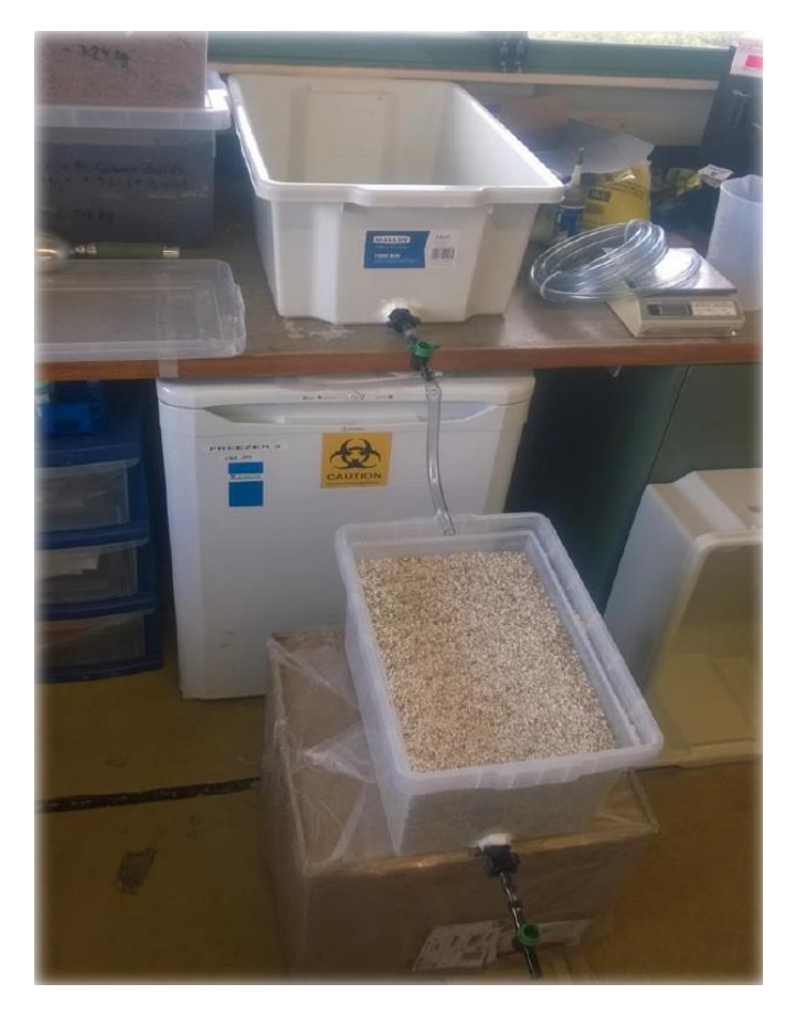
Figure 3: Laboratory set up for bench trials

Artificial stormwater prepared by mixing sediments collected from catchpits in urban catchments and demineralized water was used in the experiments. The contaminant blend and concentrations were, TSS – 6,200 mg/l, Zn – 0.380 mg/l, Pb – 0.016 mg/l, and Cu – 0.031 mg/l. These concentrations are representative of typical blend and concentrations of contaminants found in runoff from urban catchments (Moores et al., 2010).