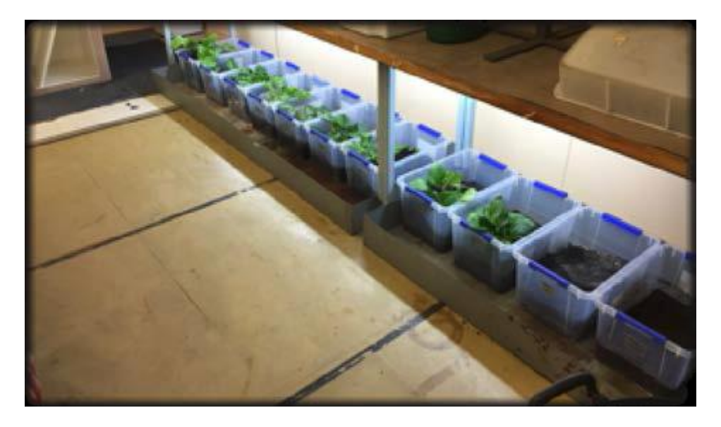
Figure 4: Laboratory set up for the second set of trials

In the second set of trials Media 3 was replaced with a blend of Grow Stones, Biochar and compost as the blend containing sawdust leached high loads of organic matter during our trials. In this set of trials, three types of plants (drooping, shrub and edible) were grown in each of the media types. The composition of all three blends of media was also altered to contain a minimum of 20% compost to support plant growth. Lab trials were conducted under artificial lighting conditions using fluorescent lights. The intensity was maintained at levels similar to those on overcast days. After initial testing, the media had to be amended to reduce the compost content less than 10% (quantity contained in the sapling pot that the plants came in) as they started leaching large amounts of suspended solids and nutrients. In addition, we had a control set of media without any plants growing in them.