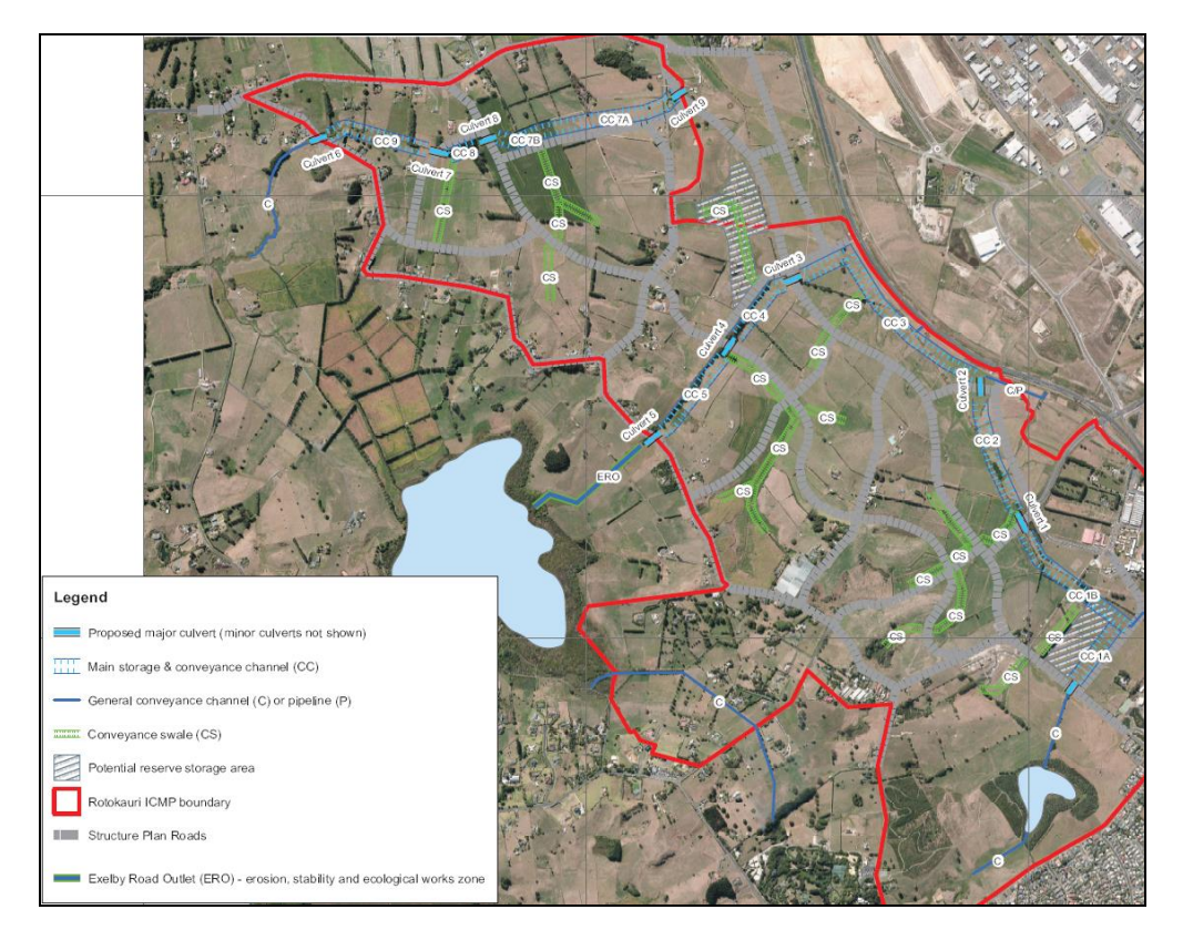
Figure 2: Rotokauri Stormwater Conveyance Infrastructure. Wetlands are located within main storage and conveyance channel in blue (CC), which is located in a green corridor. 2018 Stormwater Conference

In addition, all wetlands are required to be designed to maximise phosphorus removal through minimising depth and careful selection of vegetation.