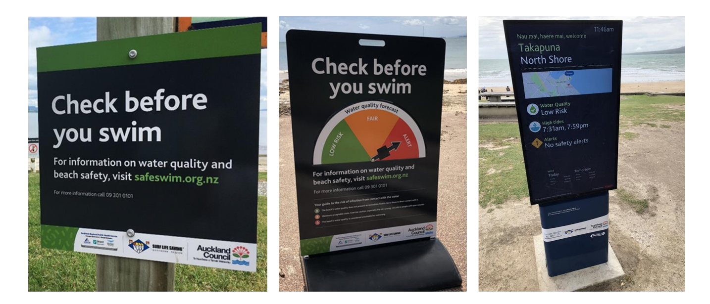
Figure 2: Safeswim sign typologies

• Digital sign – large digital sign that is controlled remotely allowing real time updates