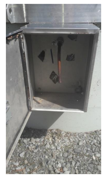
Figure 5: Example of a sample tap outside of the well head

Some wells had sample taps installed within the below ground well heads while others had sample taps situated in cabinets outside the well heads. Locating sample taps outside the well heads is preferable as it is important to avoid draining of the sample tap into the well head (see Figure 5). We note that the sample taps should not form a direct connection to the main line and should have an air gap device to prevent material being potentially drawn through into the reticulation.