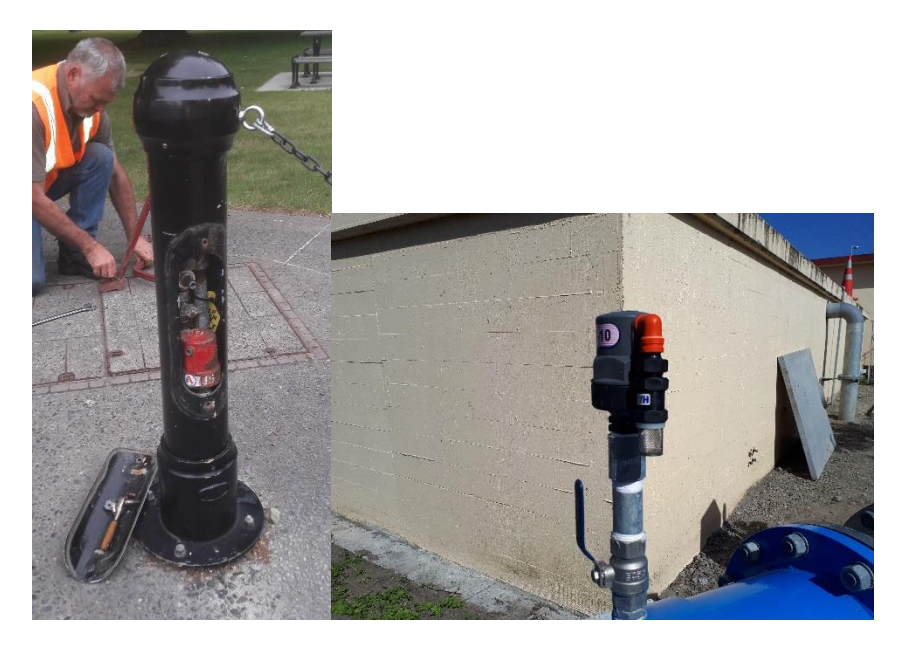
Figure 4: Examples of an air vent outside of a well head