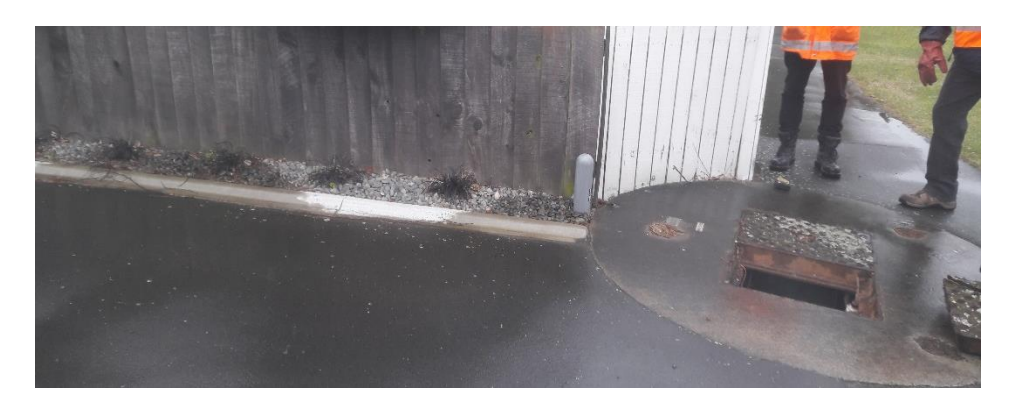
Figure 2: Example of a well head with surface water drainage paths into it