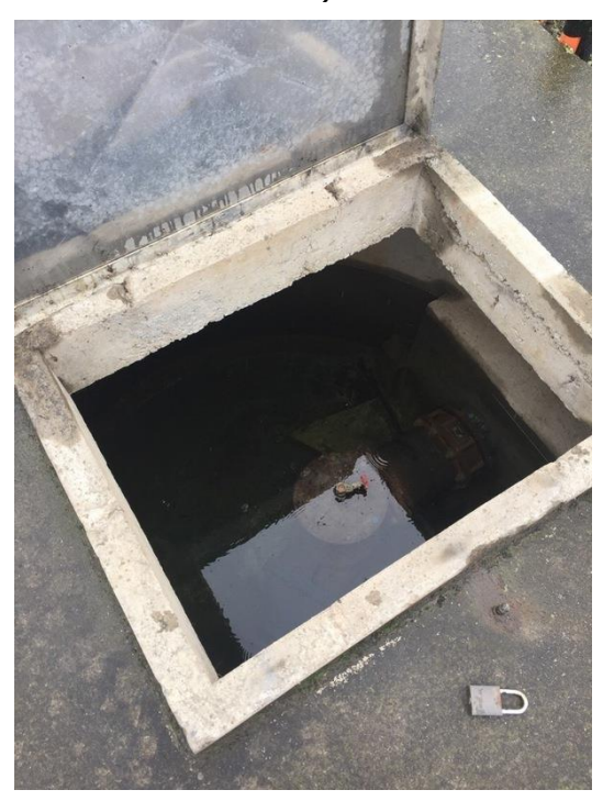
Figure 1: Example of a well head chamber filled with water

Generally, the condition of the well heads did not meet the current requirements of the drinking water standards. There were a number of well chambers that had water in them and some where the water level completely submerged the well head (see Figure 1). In some cases, this water was due to leakage from the well head, but in other cases the water entered the well head through the lid, unsealed well head penetrations, drainage pipes, and cracks in the well head. In a few cases there was only a gravel floor to the well head (i.e. no concrete floor had been installed).