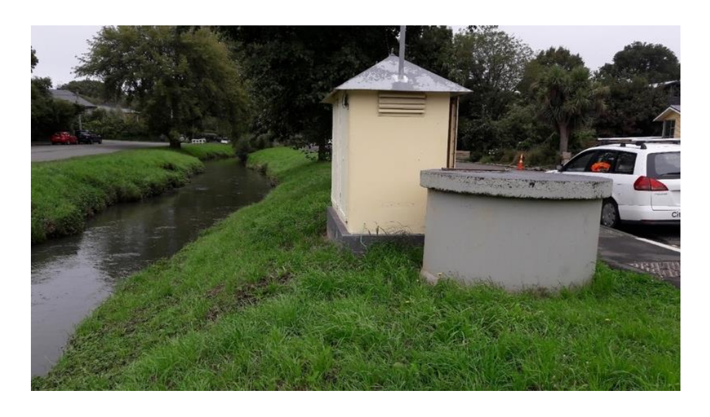
Figure 3: Example of a well head on the banks of the Heathcote River