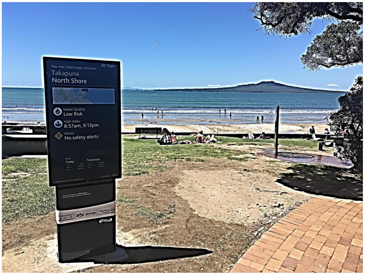
Photograph 1: Takapuna Digital Sign

As part of the programme we trailed the installation and operation of digital signs at three locations, Mission Bay, Takapuna (Photograph 1) and St Mary's Bay. The reaction has been generally positive and indicates there is real potential to use this type of signage to address the concerns of both those who want less signage and those who want more information. Some people still miss the digital sign as they approach the beach, however, indicating that there is a patchy culture of checking beach signs for information - there is a well-established expectation in some countries of comprehensive risk signage at beaches, but not, it would seem, in New Zealand.