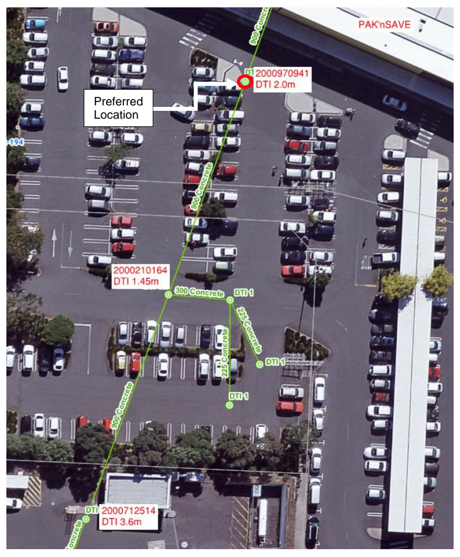
Figure 5: Potential GPT locations (Sub-Catchment 4b)

Both the VX 11000 and VC100 HF were compatible with the proposed location (based on consultation with suppliers). FDHC units were not considered for this catchment as a minimum of two devices would be necessary to support treatment flow and peak flow requirements. Both the VX 11000 and VC100 HF require high flow diversion structures due to the estimated peak flows received from the piped network. The VC100 HF and VX 11000 are reported to provide 80% removal of particles greater than 108 \mu m. The proposed options for Sub-Catchment 4b are summarised in Table 13.