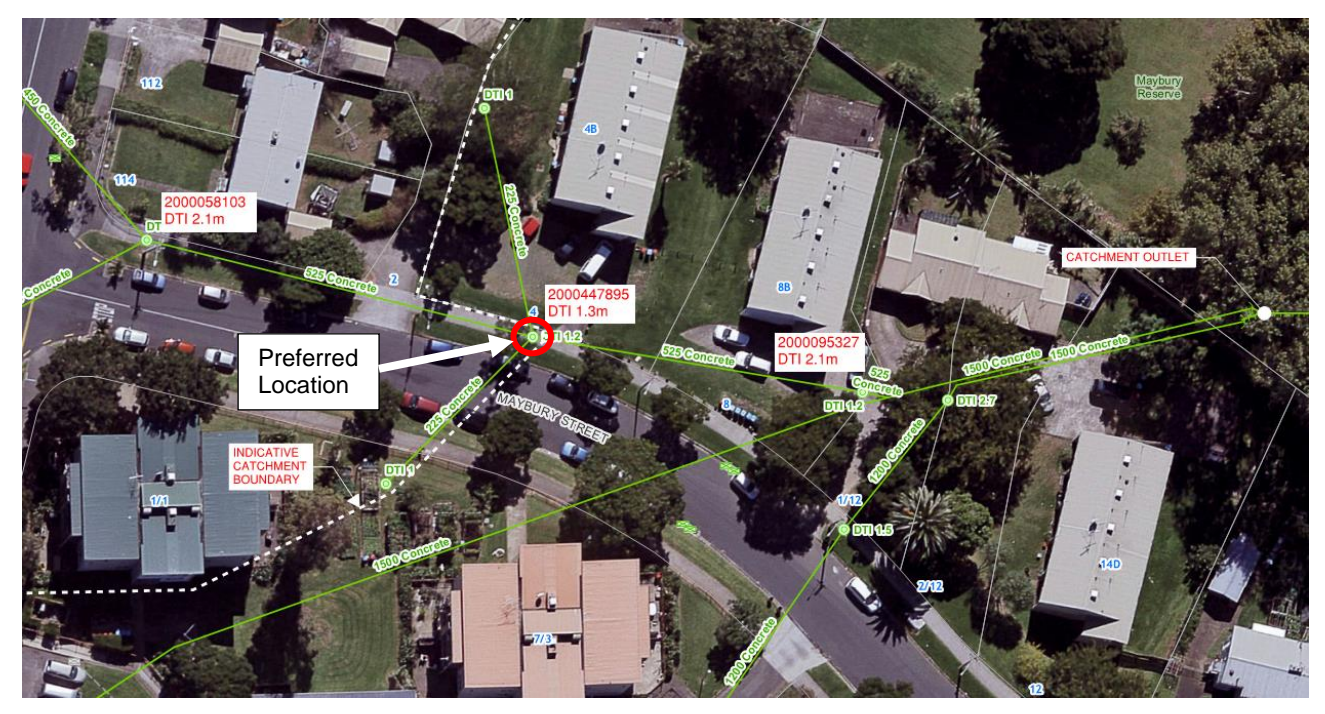
Figure 4: Potential GPT locations (Sub-Catchment 1) Table 12: Glen Innes Town Centre stormwater treatment options (Sub-Catchment 1)