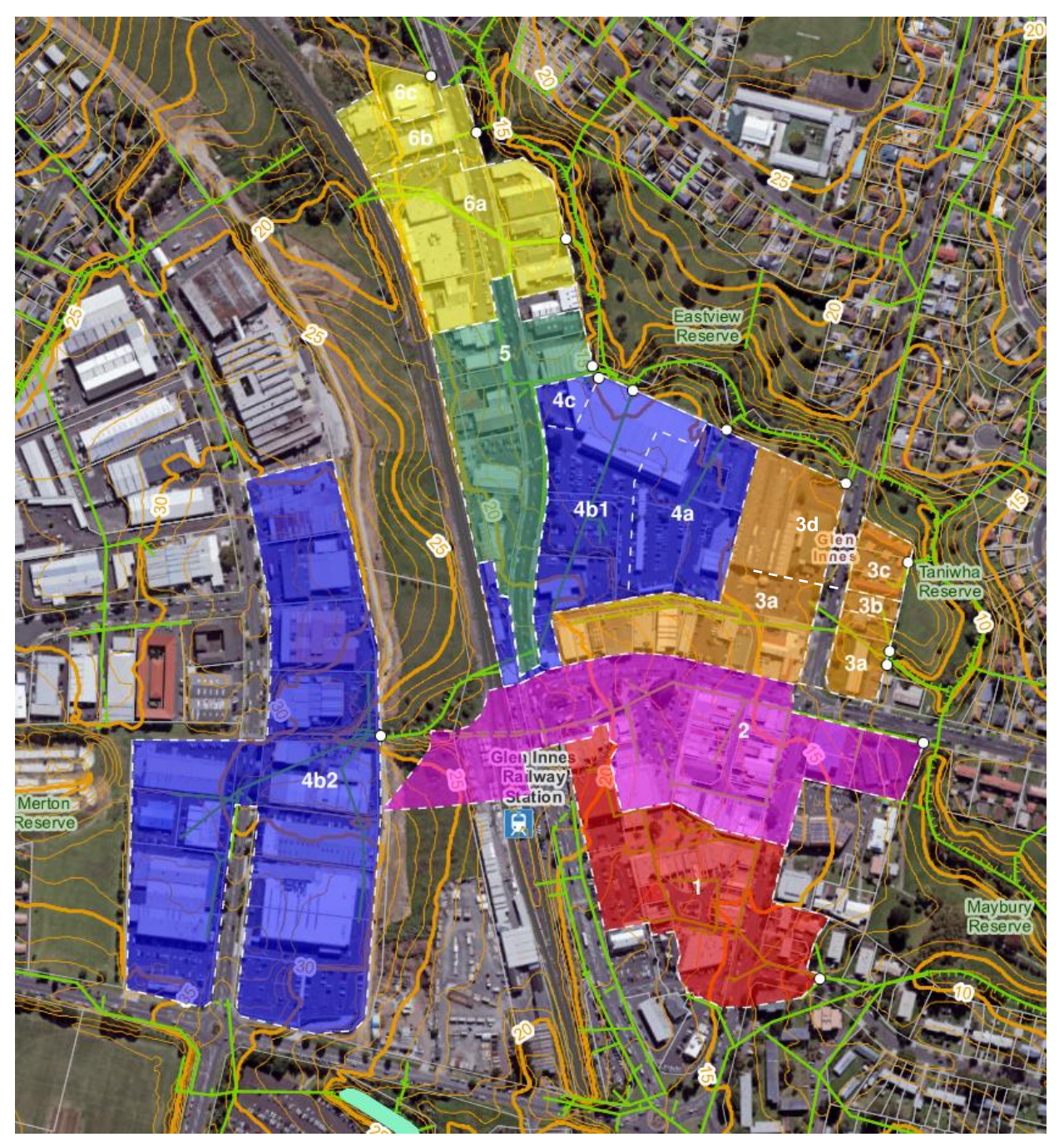
Figure 2: Sub-Catchments based on main stormwater outlets (shown as white dots)

by a series of discrete piped networks which all discharge to Omaru Creek within public reserve areas independently of each other. The town centre was divided into six discrete areas based on these discrete networks, with each area requiring separate controls to manage contaminants (refer Figure 2).