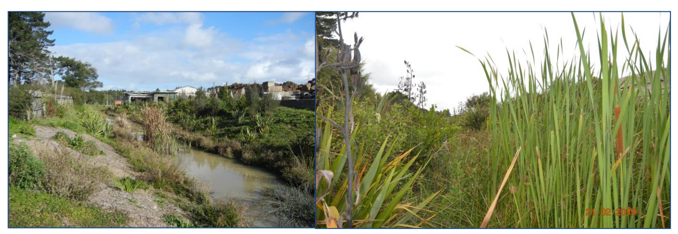
Photographs 3 & 4: Outlet for wetland 1 & 2 informal connection to wetland 2, 2019

Photograph 1 & 2: Wetland 1 2012 (3 years after commissioning) and present.