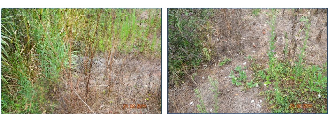
Photographs 7 & 8: Swale 1 behind commercial development

Site visits to four different swales that were designed to provide treatment and convey surface flows into the stormwater network, provided varying results. Swale 1 was nearly nonexistent due to a lack of both maintenance and knowledge. During the visit to the property the occupiers of the commercial property had no knowledge of the swale. The swale was a condition of consent and designed to provide treatment of the stormwater runoff prior to it reaching an unnamed creek at the bottom of a gully.