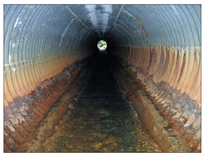
Figure 5: Concreting the invert of a culvert can extend its life, but ultimately moves corrosion and abrasion problems further up the wall.

In these instances, partial repair may be a less cost-effective option in the long term than the renewal option. The other important consideration is that the concrete layer in the invert can hamper the works when it is decided to affect the permanent renewal option. Often the original bore size of the culvert is needed so as to avoid hydraulic loss, and when this is required the concrete may need to be removed prior to carrying out permanent renewal works. Removal of the