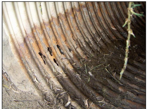
Fig 1: Perforations in the rusted invert of a corrugated metal culvert

Beneath every city in the world are sewer and stormwater pipelines reaching the end of their useful lives. But, as with road culverts, excavation and replacement is not feasible in built up city areas. But doing nothing is not an acceptable option.