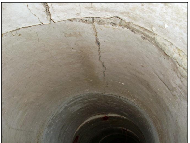
Fig 2: Cracks in the top of a reinforced concrete culvert