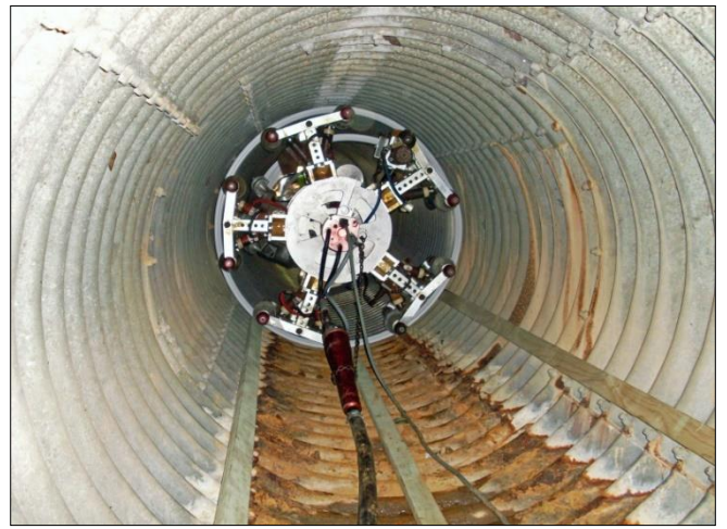
Figure 7: Rotaloc liner being installed in a corrugated metal culvert

Rotaloc uses heavier, thicker plastic strip than Expanda Pipe, so can meet the structural stiffness requirements of larger diameter liners. It is typically used for lining