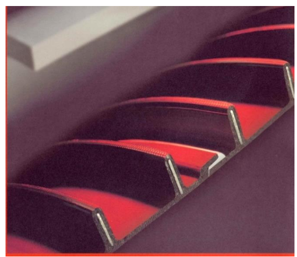
Figure 8: Cross section of Ribline polyethylene profile showing the steel reinforcement in each rib and the weld joining successive helically wound strips

The liner diameter is set by the winding head. By changing the size of the head, the diameter can joining successive helically wound strips be set to provide the largest liner that will fit into the conduit.