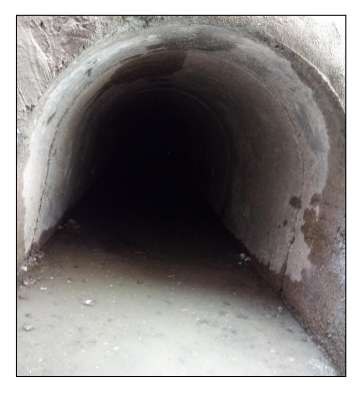
Figure 10: Non-circular culvert subject to deterioration and heavy siltation

A circular liner was installed, expanded to the maximum circular diameter that would fit. The void around the outside of the liner was filled with cementitious grout. As well as providing structural renewal, with the grouted liner designed to take all loads, lining improved the flow characteristics as the smooth circular invert as it minimised the possibility of future silt build up.