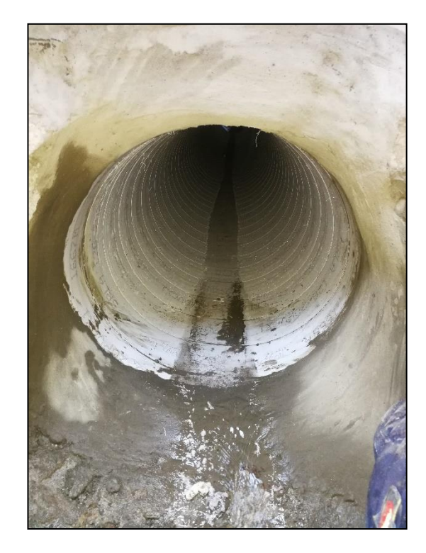
Figure 11: Expanda Pipe liner installed restores structural capacity. Curved invert reduces siltation

Rotaloc : Culverts up to 1,800mm in diameter have been lined in New Zealand with Rotaloc. The largest has been in Hastings some 2 years ago.