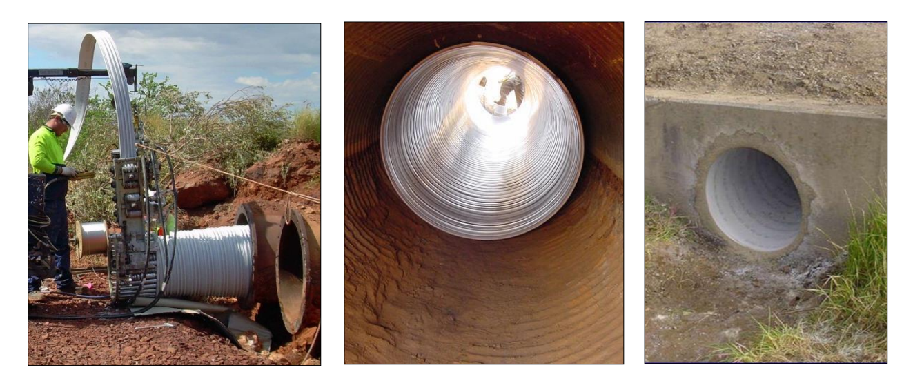
Figure 6: Installing Expanda Pipe in under-road and rail culverts

Expanda Pipe has been used in New Zealand for some 15 years. Since 1991 over 3,500 kilometres of deteriorated pipeline have been lined throughout New Zealand and Australia, mostly in deteriorated sewers.