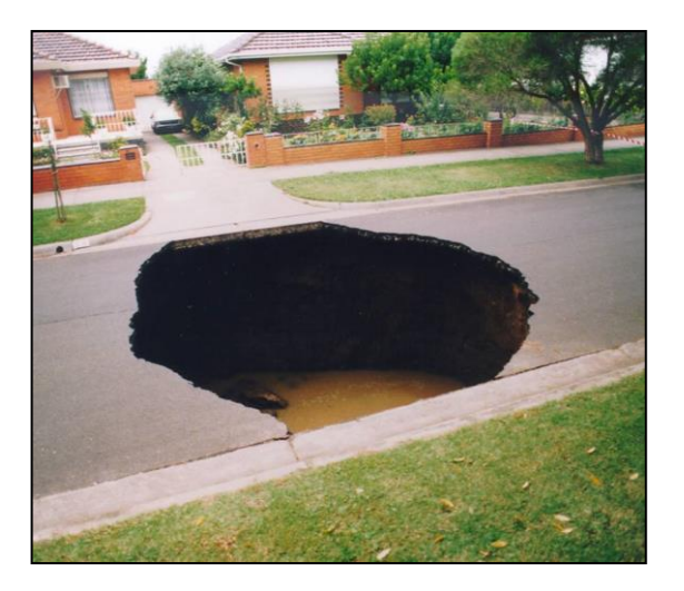
Figures 3 and 4: Road collapses caused by embedment being washed into a deteriorated or defective culvert or pipeline, leading to the formation of voids beneath the surface.

In response to this need, the Trenchless Technology industry has come into being, offering solutions that restore the structural and flow capacity of deteriorated underground pipelines using methods that require minimal excavation and which cause minimal community disruption. The best of these solutions offers: