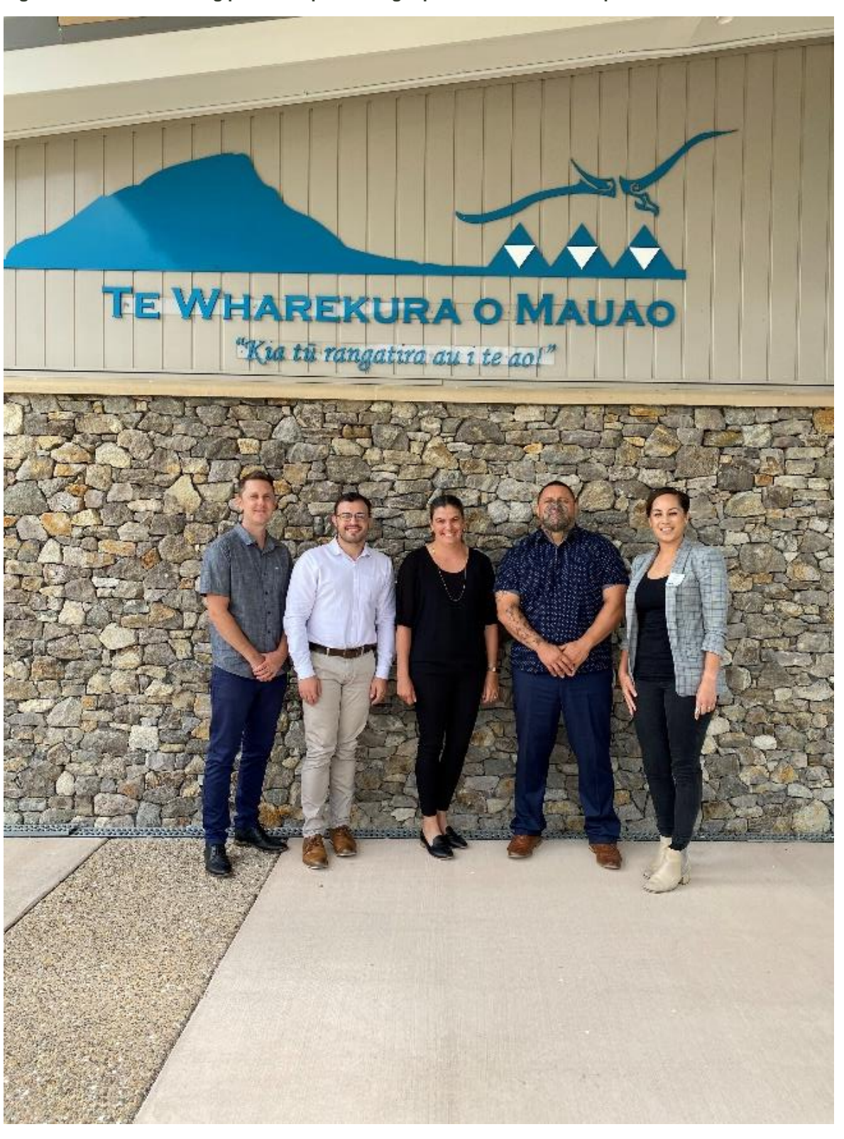
Figure 3: Initial hui forming partnership including representatives from all parties

All their tauira are contributing members of the school whānau and collaborative relationships are fostered with whānau, hapū, iwi and hāpori whānui. This ensures they enhance the sustainability of Tauranga Moana Reo and enrich our rangatahi with traditional practices and values.