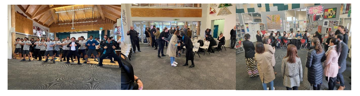
Figure 4: Kapa haka performance (left), hongi after pōwhiri (centre) and classroom tour (right)

The first interaction with the students was a pōwhiri held at the end of Term 2 prior to the programme starting in Term 3. This was the first pōwhiri experience for many of our staff and was an amazing experience for all involved. It helped to provide introduction to customs in a safe environment where the emerging professionals were able to be comfortable about asking questions and be coached through the custom with support from Toi Kai Rawa and Priority One.