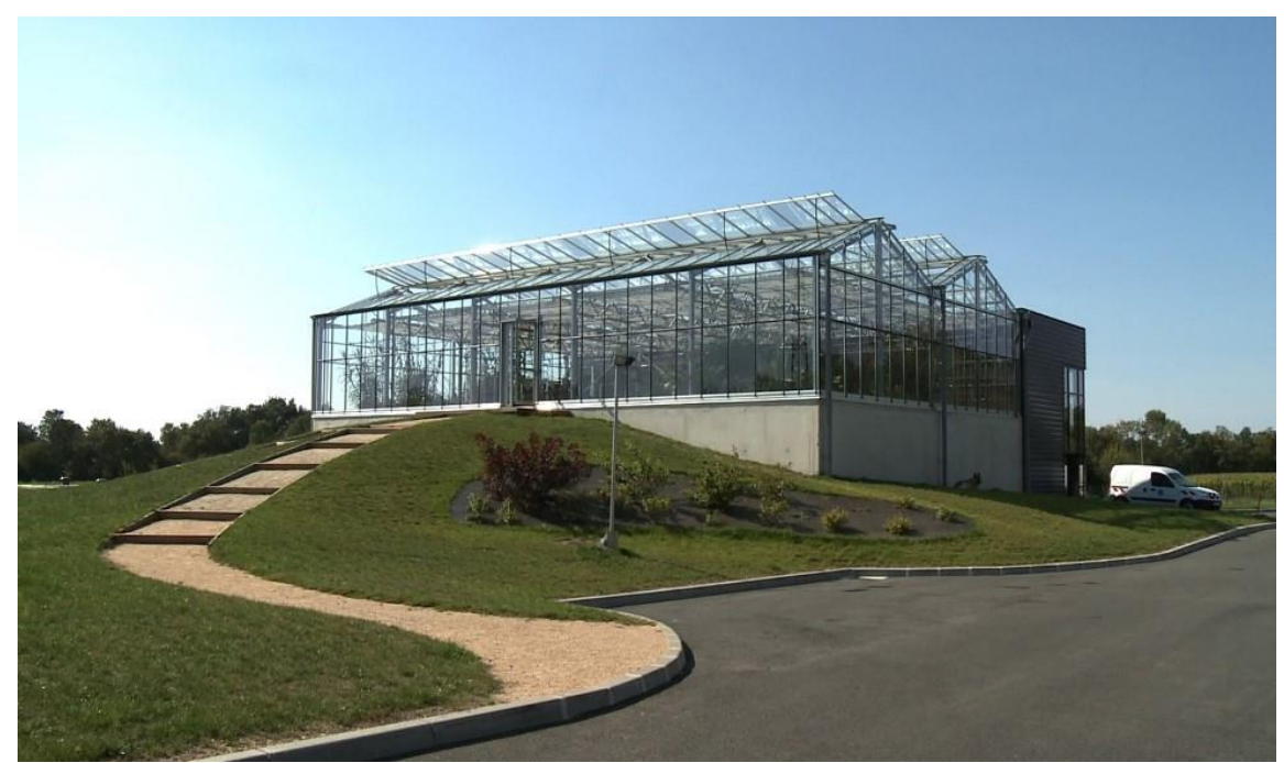
Figure 3: Le Lude STP – France. A view of the integrated process

positive attitude from local communities.