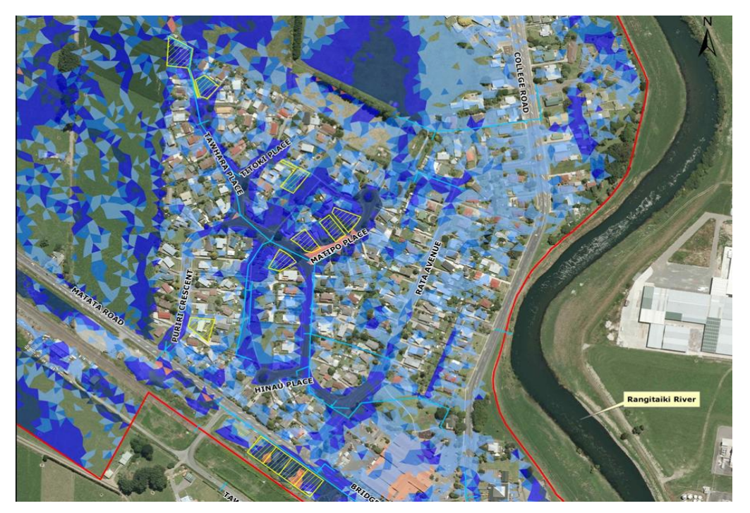
Figure 5 – Maximum Modelled Depth, Existing Pipe Network, 10-year '2090' Rainfall event, and Flooded Habitable Floors.

The described flooding was well verified by speaking with locals affected by the flooding, including a local fireman who assisted in the 2011 flood recovery.