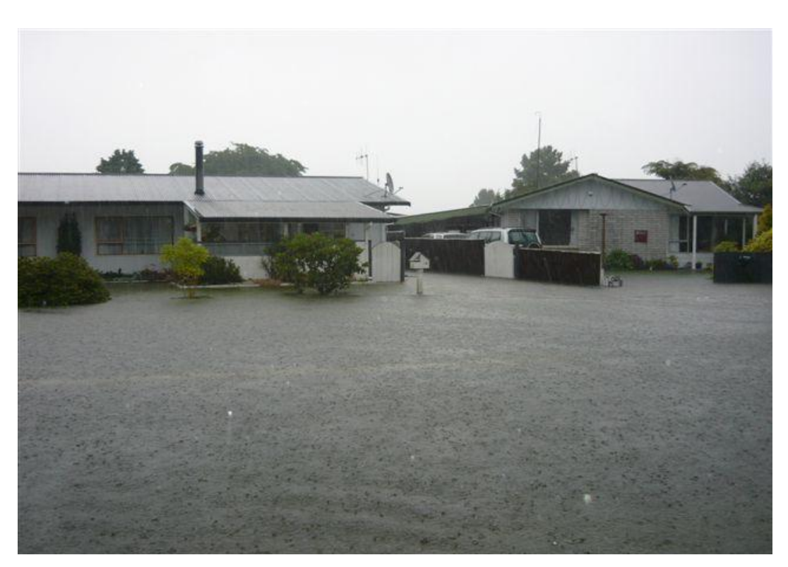
Figure 4 – Flooded properties on the corner of Puriri Crescent during January 2011 urban floods

With over three times more water entering the Edgecumbe wastewater system than would be expected for a town of this size, it was clear that the stormwater infiltration issues needed to be addressed and minimized. Ever since the 1987 earthquake locals have deemed the two meter subsidence to be the cause of a lot of the wastewater and stormwater issues, however, prior to the earthquake these issues were present. Due to damage and faults, there was definitely higher inflow and infiltration of water into the system through cracks and seepage. This puts an extremely high amount of pressure on the lines and oxidation ponds to hold volumes that they are not designed for, and in turn leads to overflows. Overflows increase the level of stormwater flooding, are a public health risk and also cause significant inconvenience to the community and council. WDC have strategically incorporated the stormwater