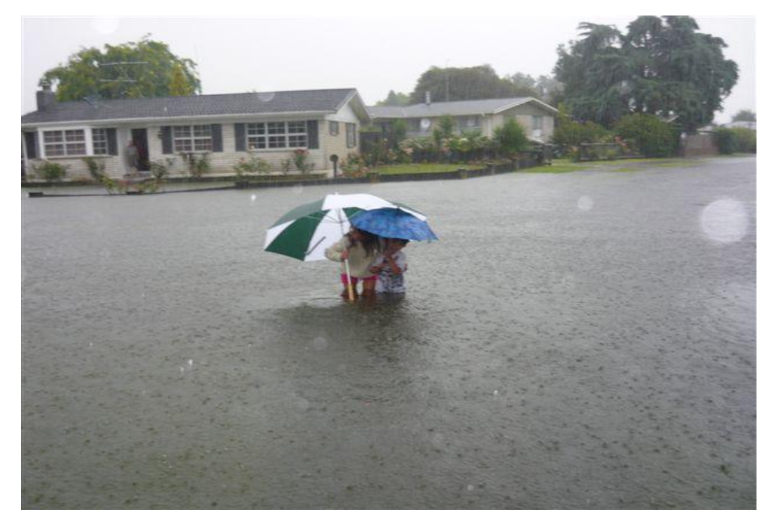
Figure 3- Children wading in urban flooding in January 2011on Matipo Place in the study area.