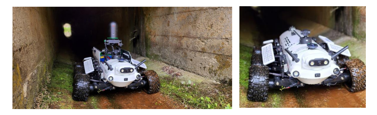
Figure 2: Pipe-i robotic scanner on a recent culvert monitoring project

The Pipe-i is a good example of integrating rapidly advancing technology coupled with reality modelling and analysis. This innovative approach fuses advanced technology to boost traditional analysis that in turns feeds into better asset management. It offers a step