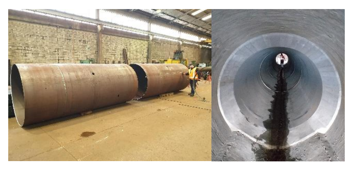
Figure 4: The SH35 culvert: steel liner sections on the left and post install on the right.

To track if the culvert was deteriorating over time, several scans were taken and compared. The deformation, shape and cracks were not found to be significantly changing over several years allowing a lined solution to be adopted and installed rather than a complete dig out and rebuild. Refer Figure 4 below.