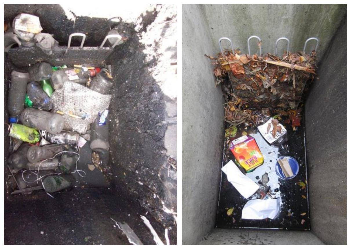
Figure 8: Catchpit Pollutant Trap installed in Catchpits