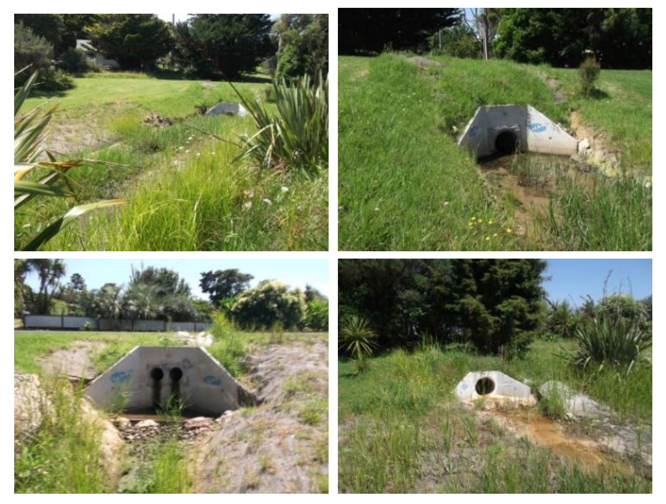
Figure 9: Detention Basin clearing and inlet/outlet protection

GHD, Auckland Transport and Auckland Council SW have been proactive in managing the Gulf Island issues through improved inlet/outlet protection, installed structures to minimise erosion at outlets and maintain flow conveyance, installation of low cost treatment devices to manage pollutants and blocked catchpits, instigating cleaning and maintenance regimes for detention basins and open channels to remove litter and excess sediments, trimming vegetation and grasses and maintaining capacity including scour protection.