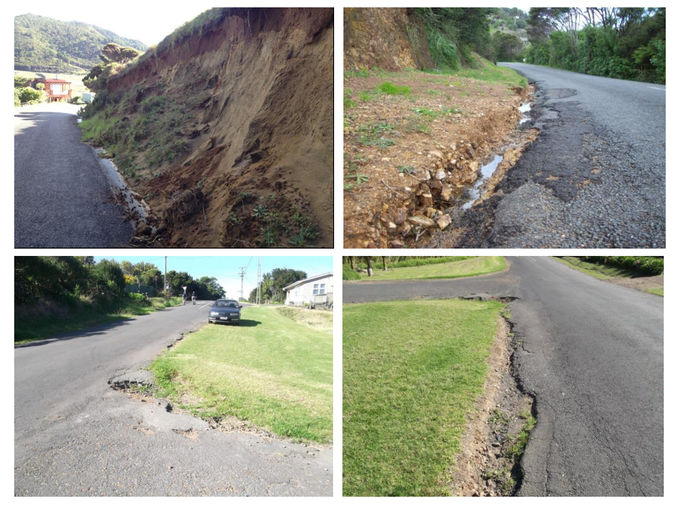
Figure 2: Gulf Island Bank Erosion, road scabbing, scour and stormwater inlet issues

Environmental Sustainability – Minimise network stormwater pollution. Eliminate RMA non-compliance with a service measure of compliance with environmental standards for water pollution and percentage coverage of environmentally significant catchments with appropriate treatment.