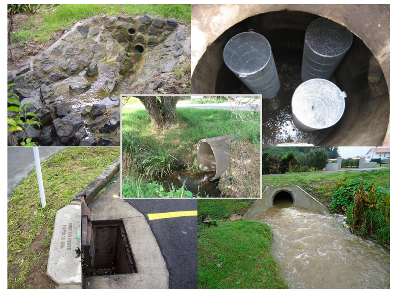
Figure 1: Auckland Transport Stormwater Assets

The benefits of this programme are potentially wide reaching, as it is not only of value to Auckland Transport and other stakeholders in Auckland who are responsible for the quality of the receiving environment but also to environmentally aware Transport entities anywhere.