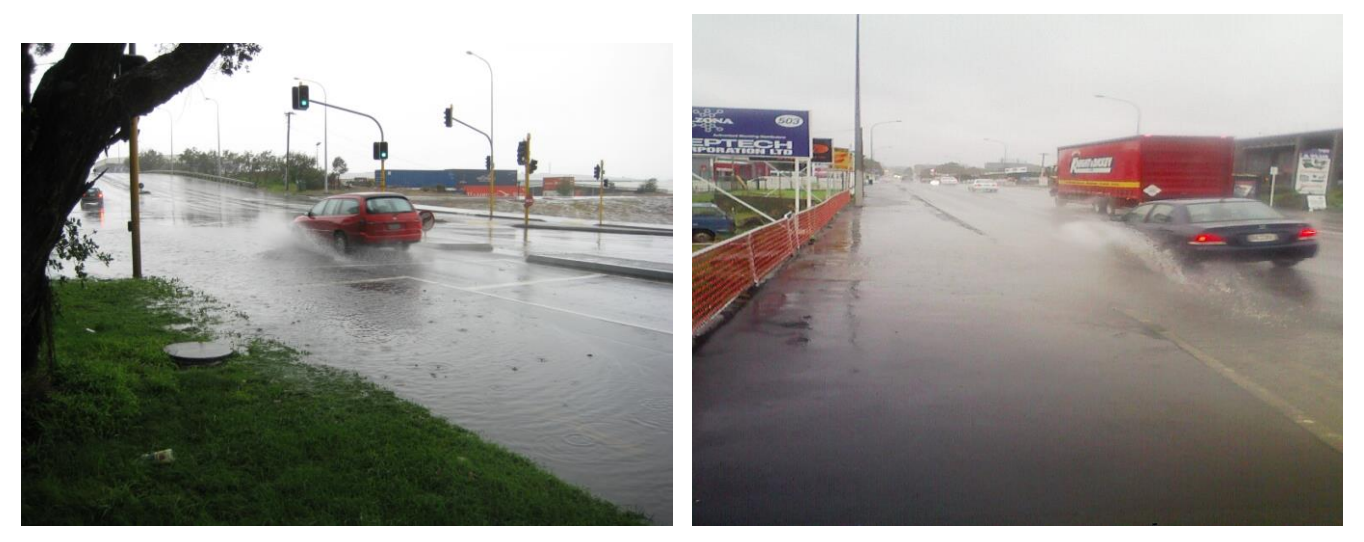
Figure 4: Carriageway Flooding