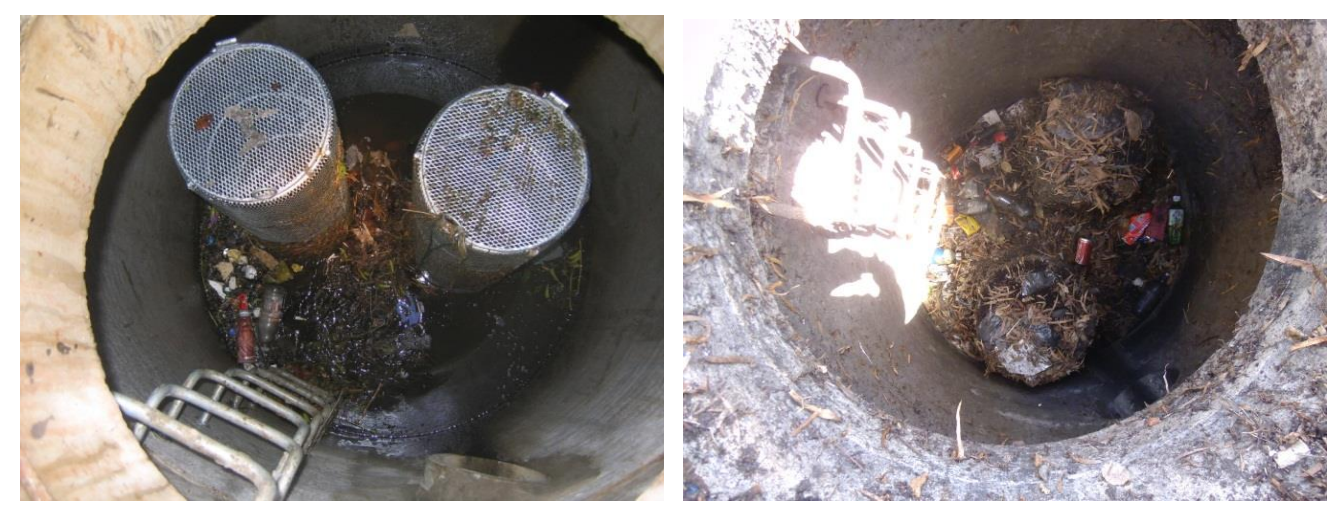
Figure 6: Gross Pollutants in Soakhole

Auckland Transport is building on this work to develop improved asset data records, including borehole capacity field test records, to enable discharge management, cyclic maintenance and asset renewal to improve the reliability of service in design storms and maximise cost effectiveness