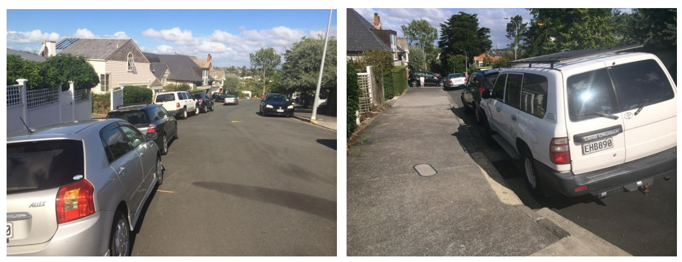
Figure 3: Congested streets with vehicles parking over catchpits

of new drainage; and increased on-street parking that makes it difficult to access drainage and associated structures for maintenance programmes.