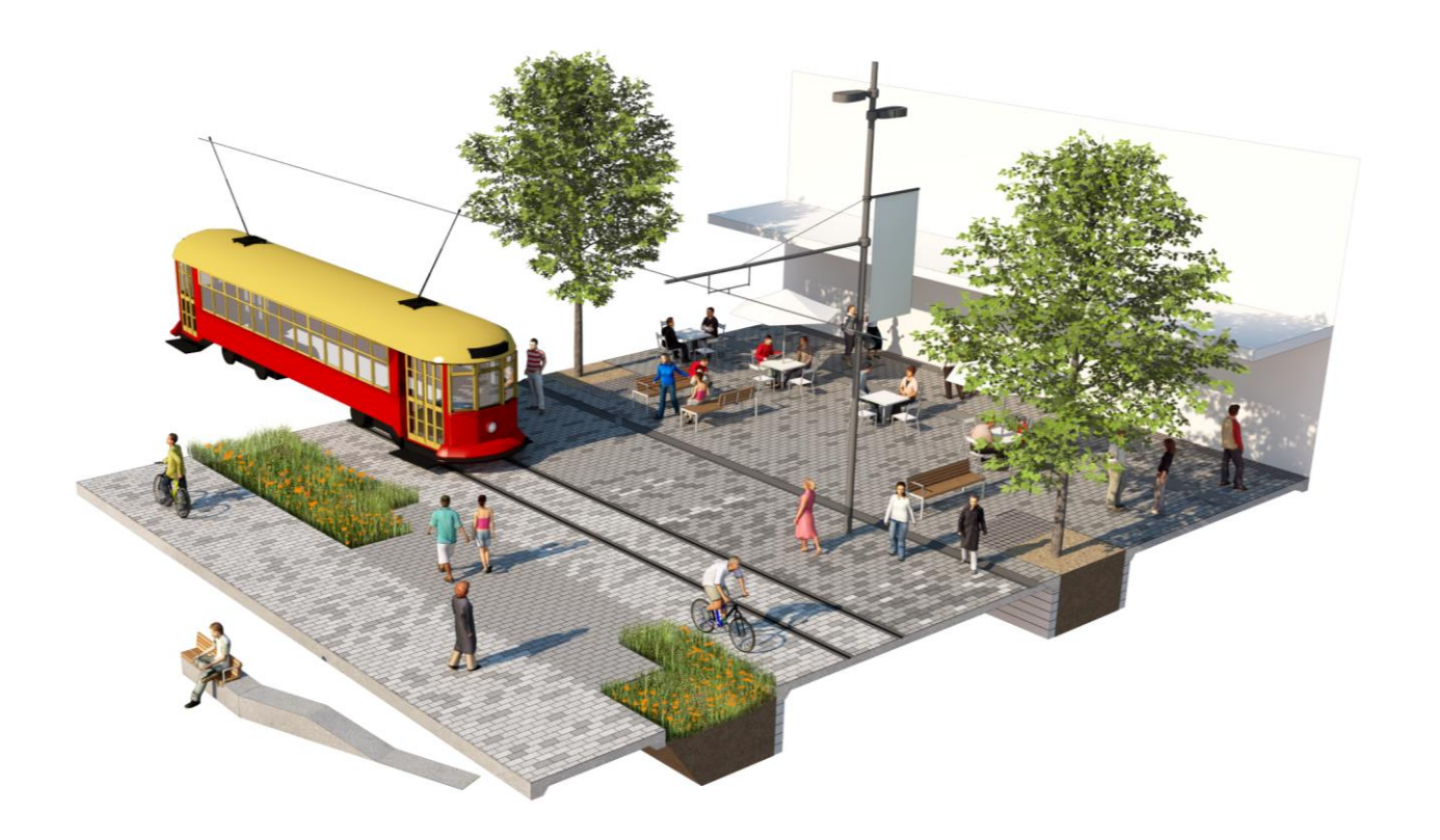
Figure 2 – A 3D rendering of the proposed urban landscape (Terraces) showing rain gardens on the left.