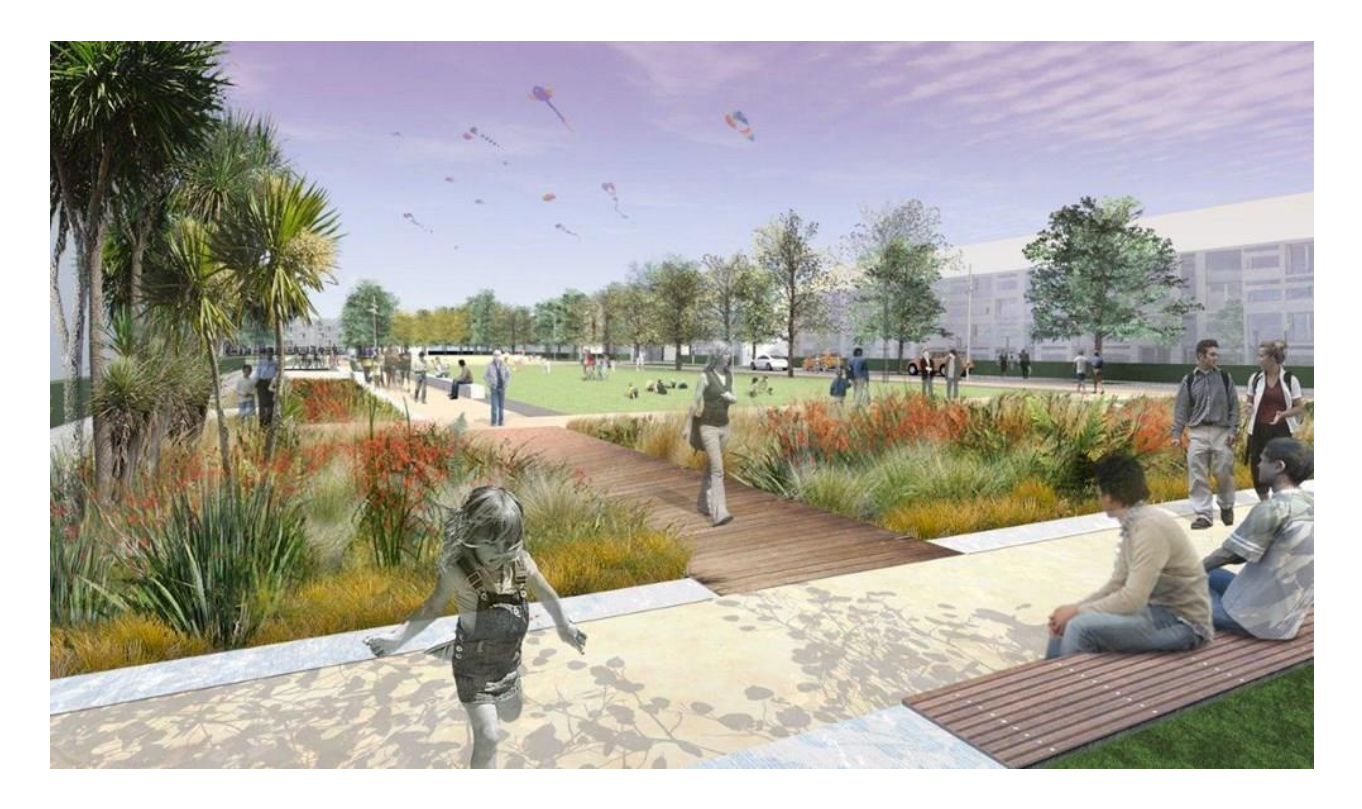
Figure 4 – East Frame, showing the rain gardens as a key design feature

In order to provide confidence in performance, Opus worked with LivingEarth to develop three trial soil mixes which aimed to balance soil moisture retention with acceptable infiltration rates. Opus than carried out testing on the three mixes to determine infiltration performance and drought resilience so that the best performing mix could be taken forwards for use.