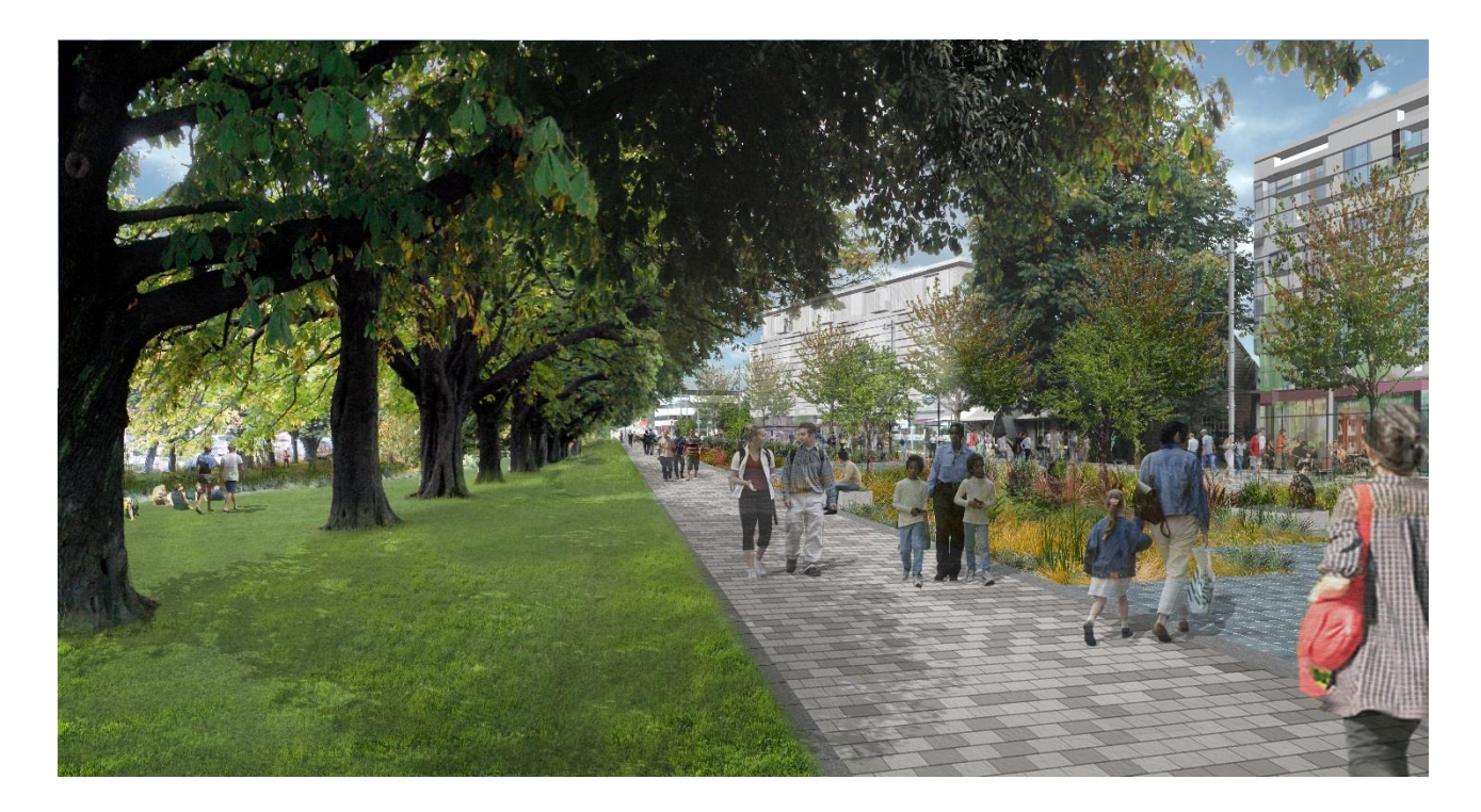
Figure 3 – Antigua to Durham, showing the rain gardens as a key design element

The rain garden sizes were determined by the urban design team, based on the scale they deemed appropriate. This generally resulted in rain gardens larger than would conventionally be required. This had a four-fold benefit; it did not compromise the designer's vision; being oversized should reduce maintenance frequency; it further reduces discharge rates to the Avon and saved the project money, as the pavement was more expensive per m^2 than the rain gardens.