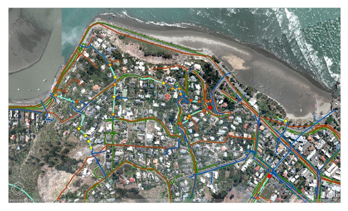
Figure 2: Example of the combined review data showing criticality score of each water course (coloured lines) and priority score colored dots. Refer to legend (below)

This simple equation allows all the watercourses in the eight projects areas to be ranked and allows the CCC to direct available resources to the infrastructure most likely to fail with the highest consequences of failure first.