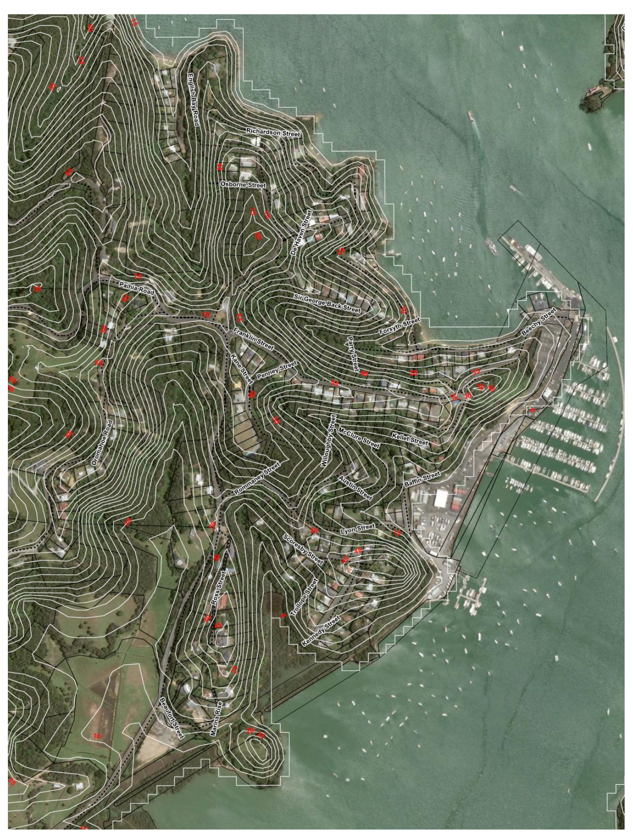
Figure 1: Opua Street Plan and 5 m Contour Levels