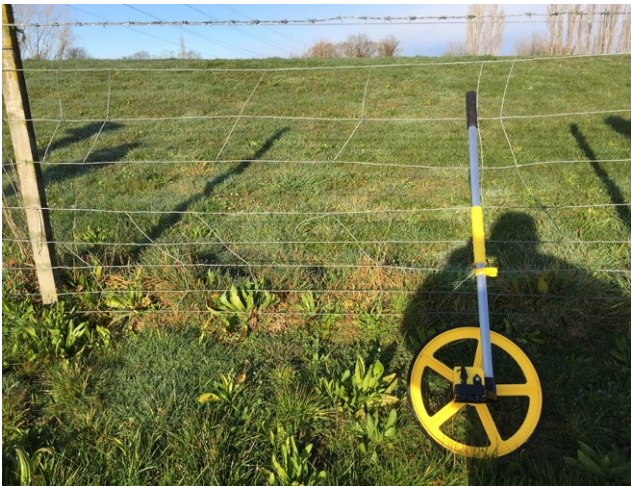
Photo 3 - Going through gaps