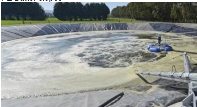
Photo 9 - Floating pontoons