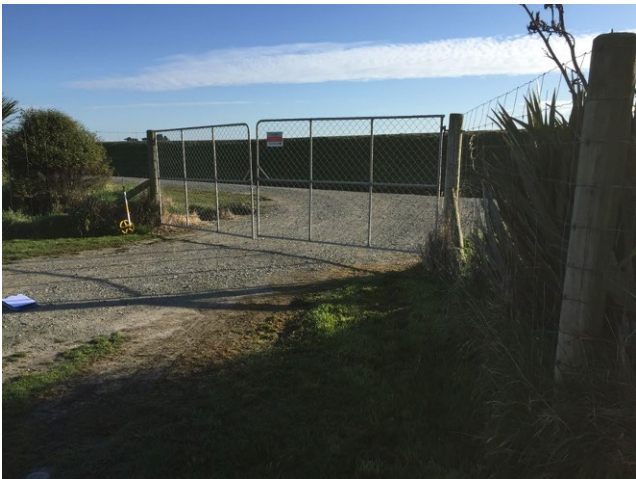
Photo 5 - Crawling under the bottom