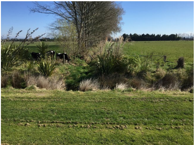
Photo 6 - Stock-proof fence not necessarily child or small animal-proof