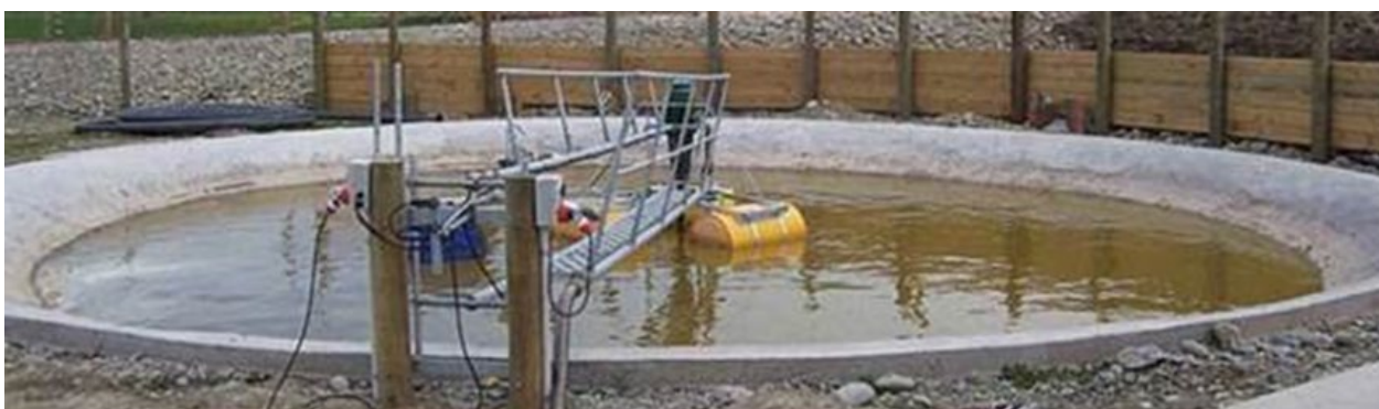
Photo 8 - Steep batter slopes