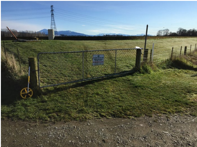
Photo 2 - Large mesh netting