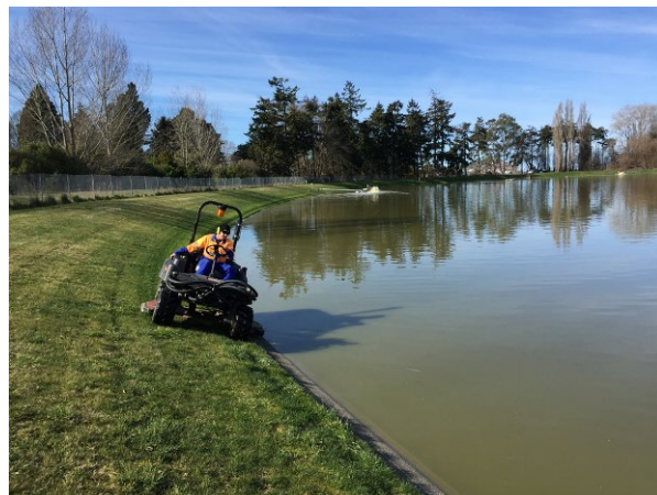
Photo 7 - They were at work