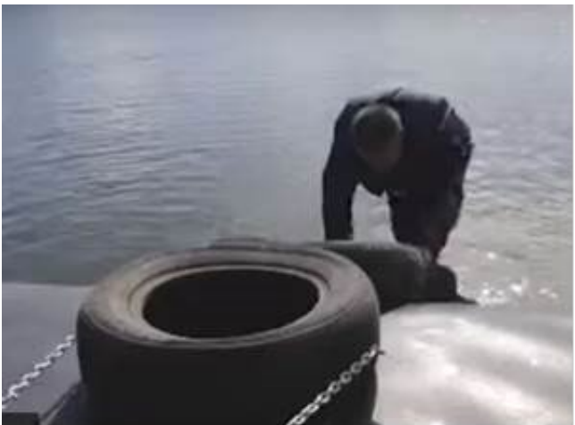
Photo 13 - Tyre Ladders