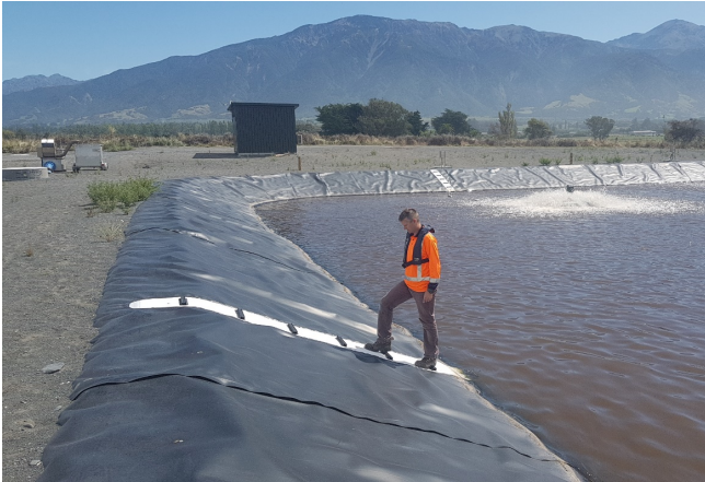
Photo 11 - Viking Geoladder