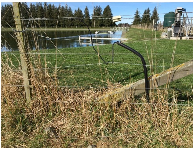
Photo 4 - Squeezing through wires