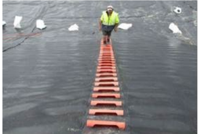
Photo 12 - AEL Hi-vis Safety Ladder